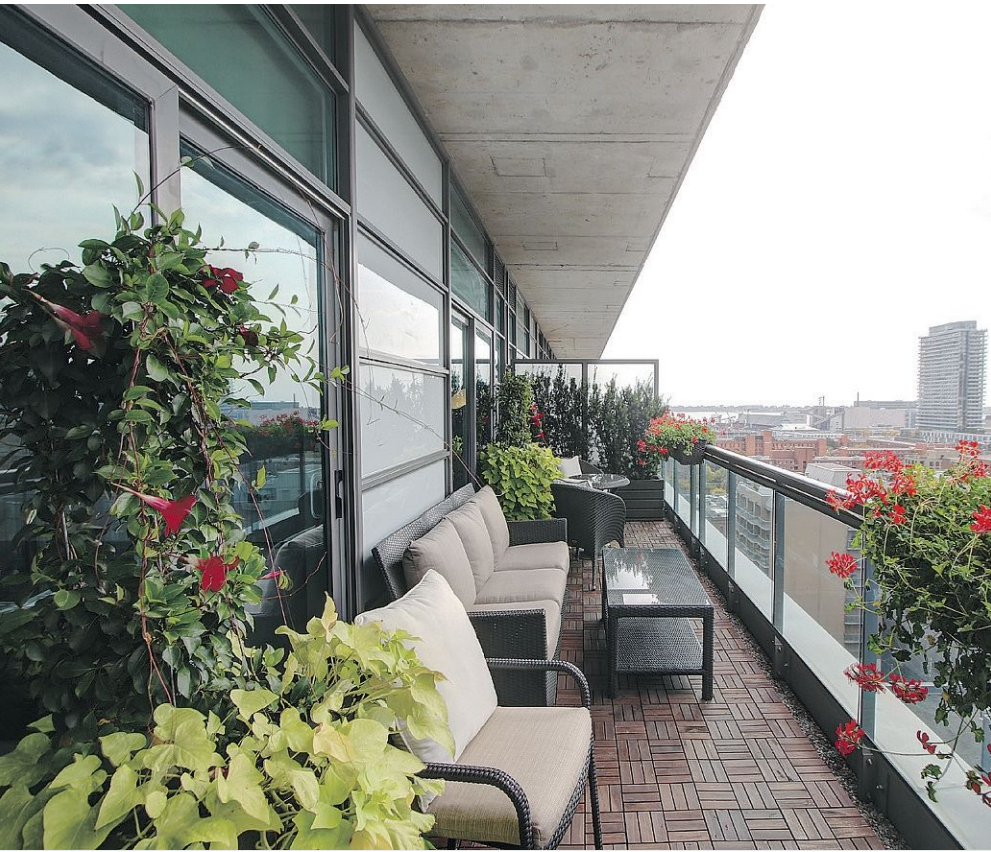
The renovated suite includes a cozy three-sided gas fireplace. The terrace is large enough to grow your own vegetables (or just get them at nearby St. Lawrence Market).

Moss Park 333 Adelaide St. E. #1412 (Adelaide Street East and Sherbourne Street) Asking price: $1,048,888 Sold for: $1,210,000 Taxes: $6,206 (2016) Bedrooms: 2 Bathrooms: 3 Time on the market: one day