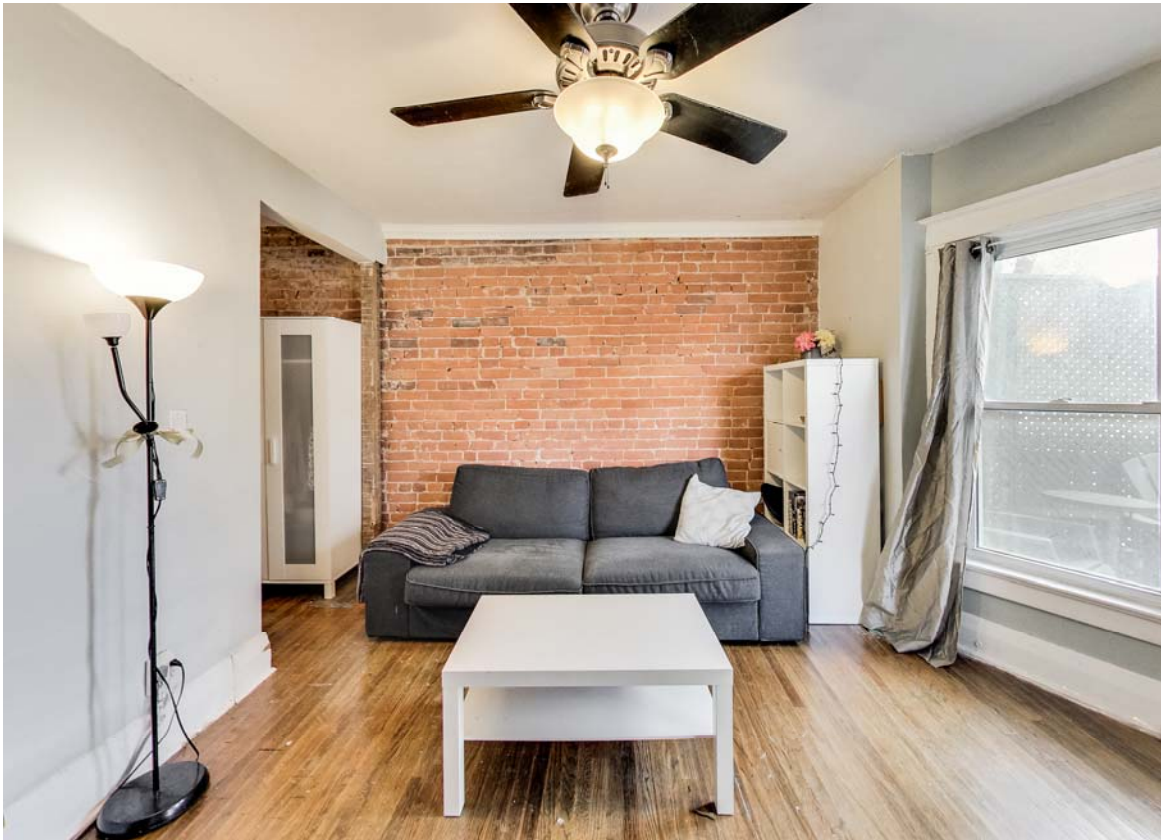
Living Room also has its own Walkout to a Front Balcony