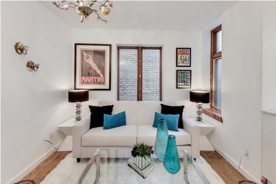
2-storey, Semi-Detached House, Split into Two Self-Contained Suites