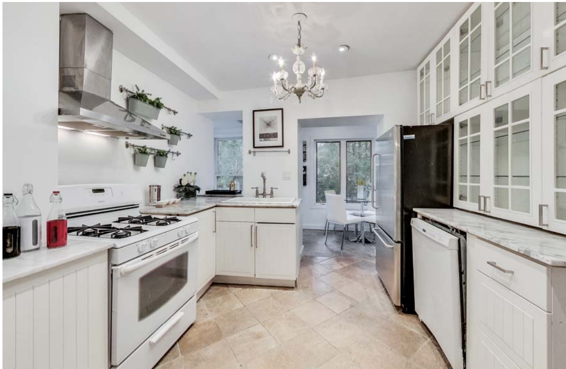
Large Eat-In Kitchen and a Walk-Out to a Fenced-in Backyard