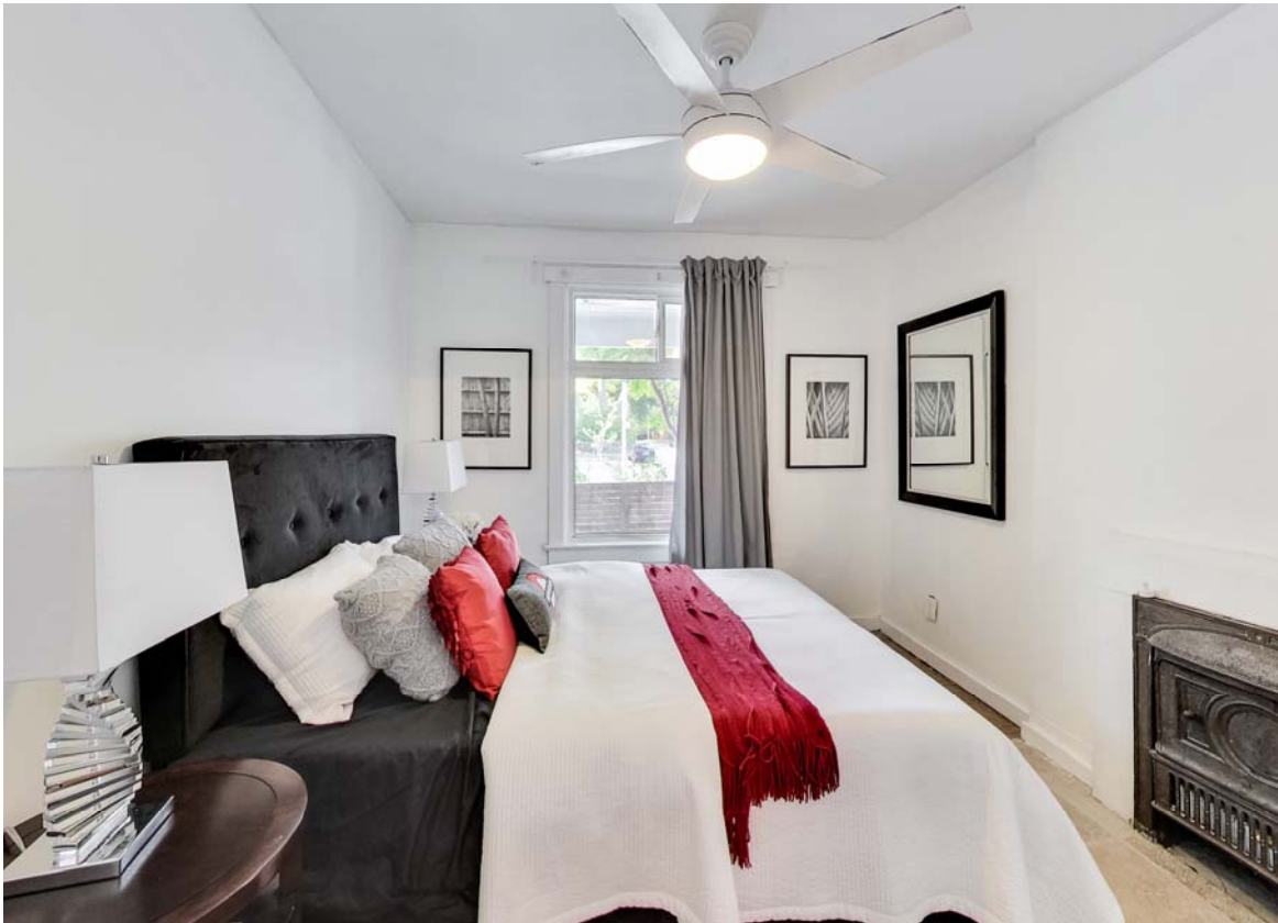
Main Floor and Finished Basement Include Rooms for 2 Bedrooms