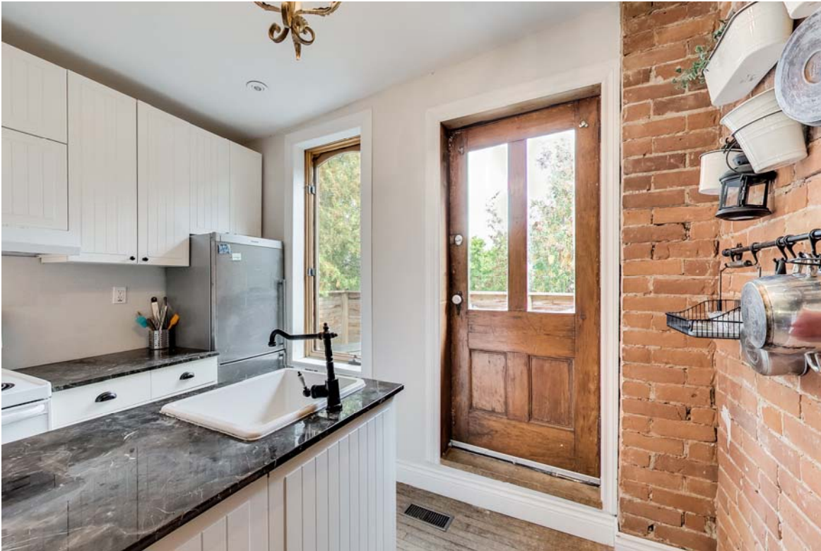
Second Floor Suite Boasts a Fabulous Kitchen with Walk-Out to a Leafy and Private Balcony