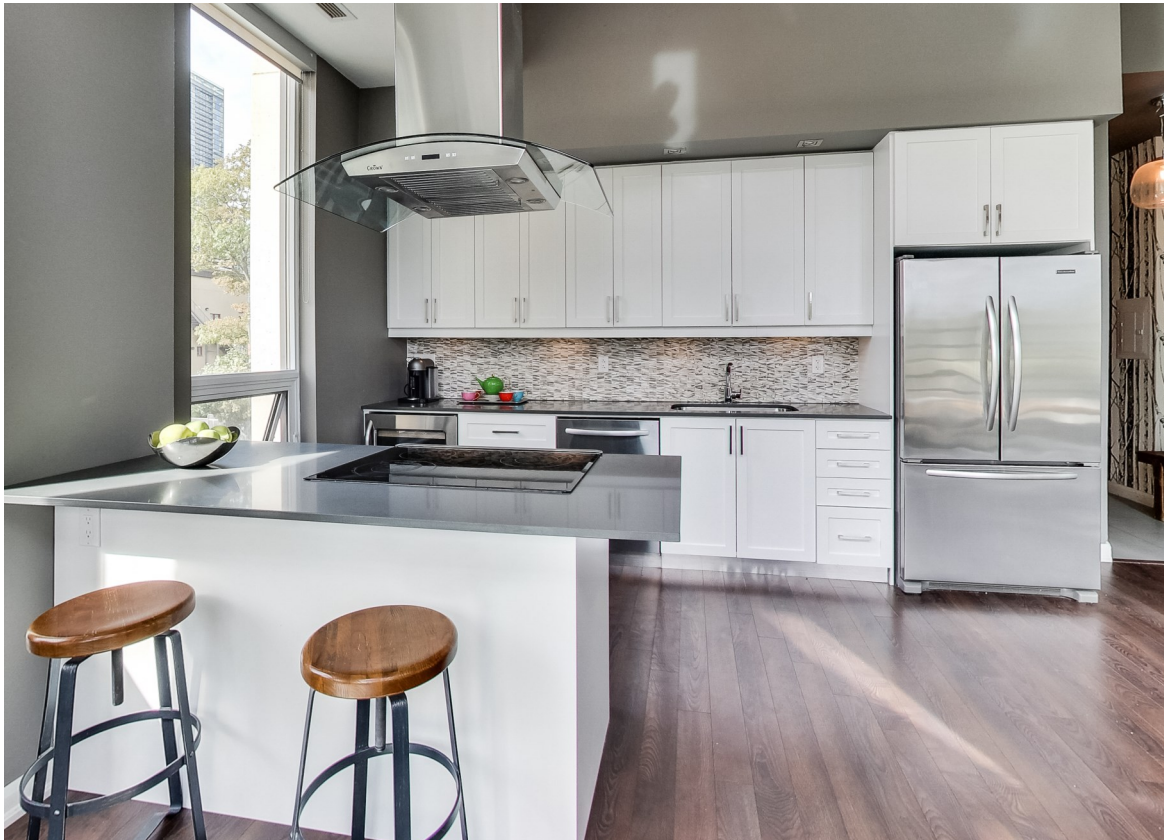
Bright, spotless and modern kitchen with built-in stainless steel appliances, breakfast bar and high-end finishes