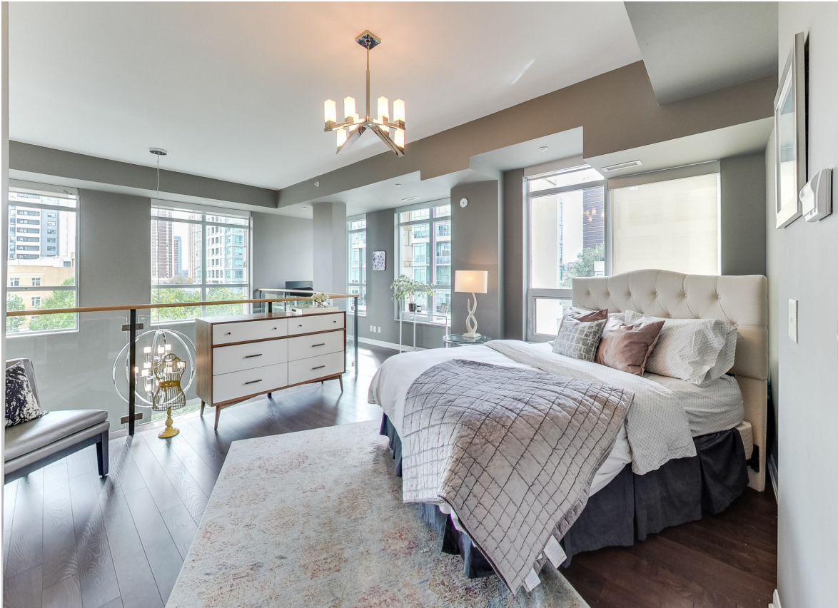
Spacious master suite with open-concept den and ensuite bathroom surrounded by dramatic views and drenched in warm sunlight