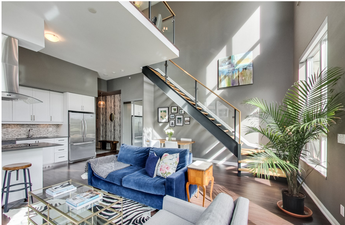
Sensational open-concept main floor with soaring high 22 foot ceiling, dramatic staircase and guest powder room