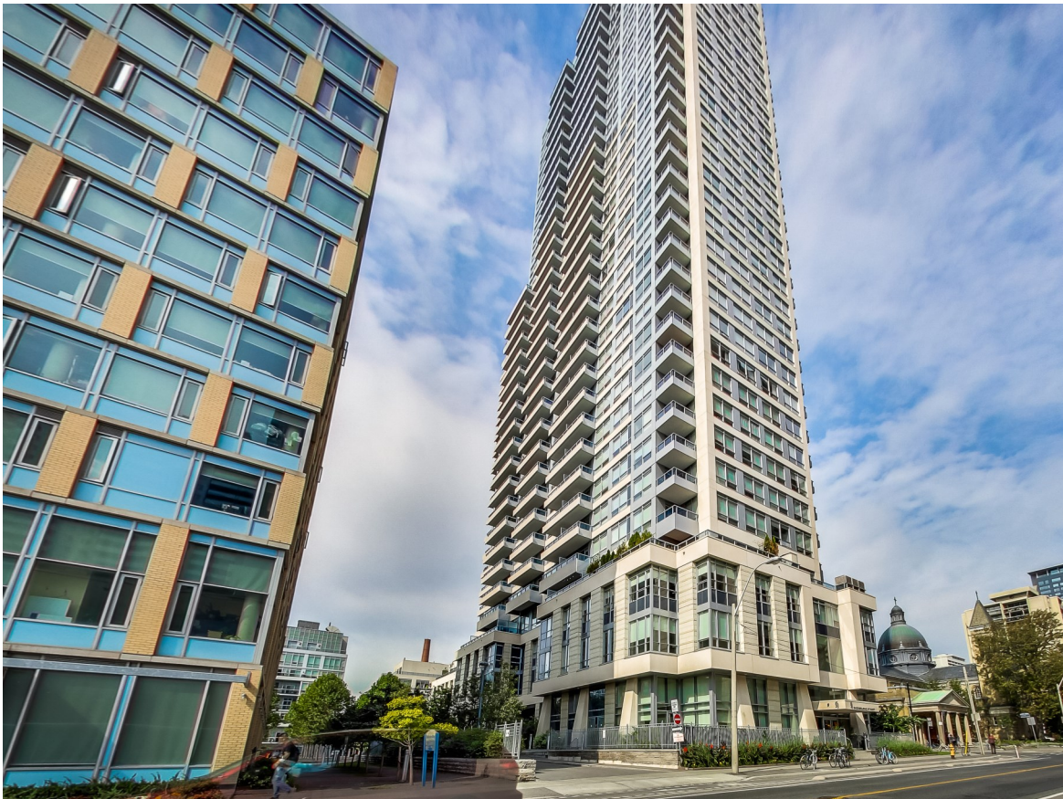
Welcome to 500 Sherbourne Street, Suite 217