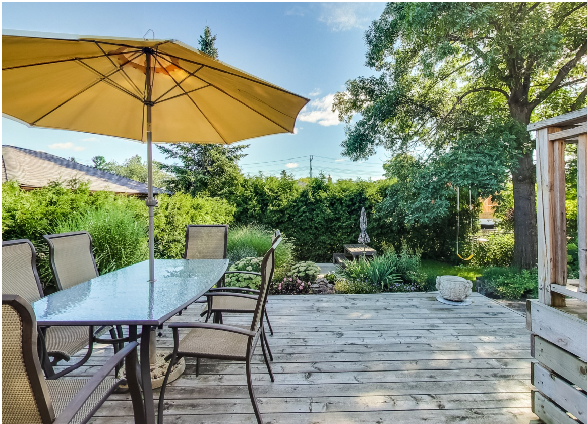
The backyard is a true retreat that's perfect for summer BBQs. Just move-in and enjoy!