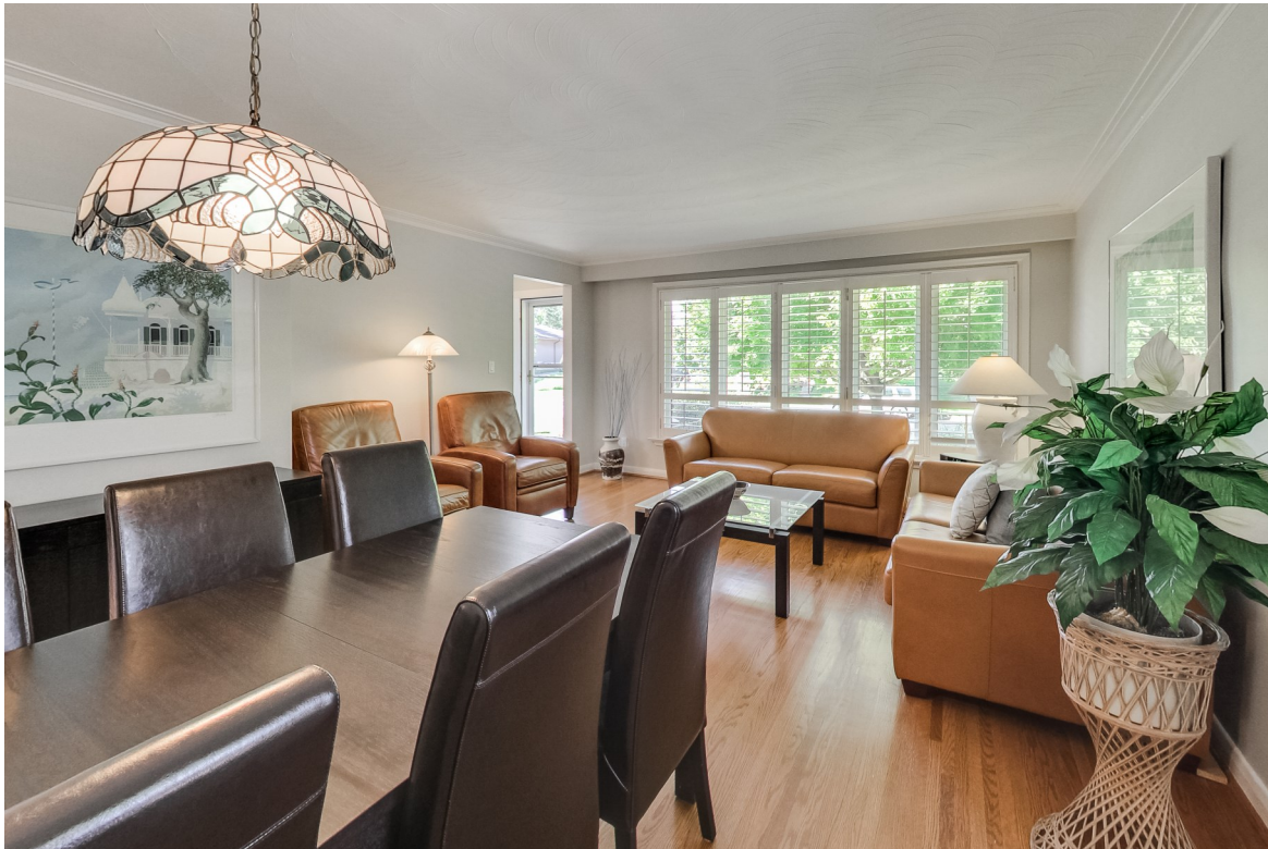
69 Droxford boasts 3 bedrooms, 2 bathrooms and is beautifully maintained with a spacious layout