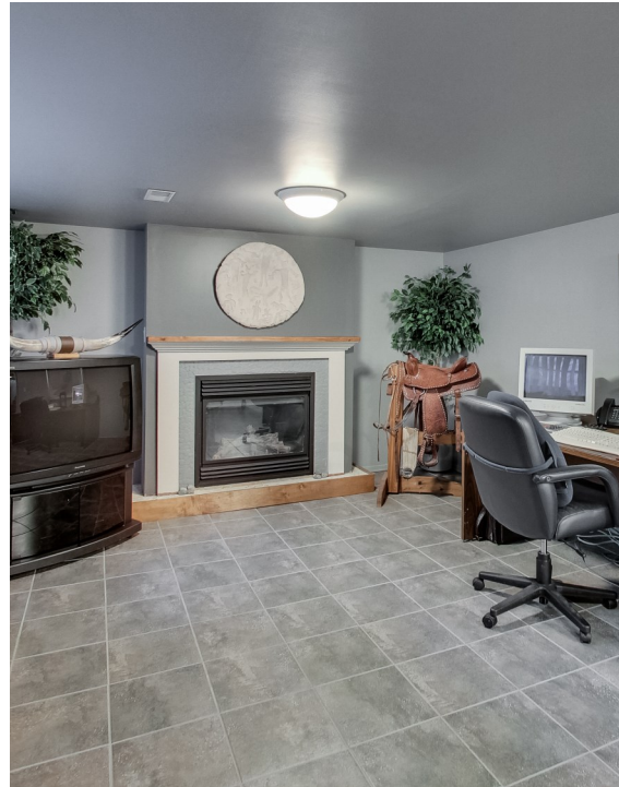
Large spacious rooms throughout the whole house