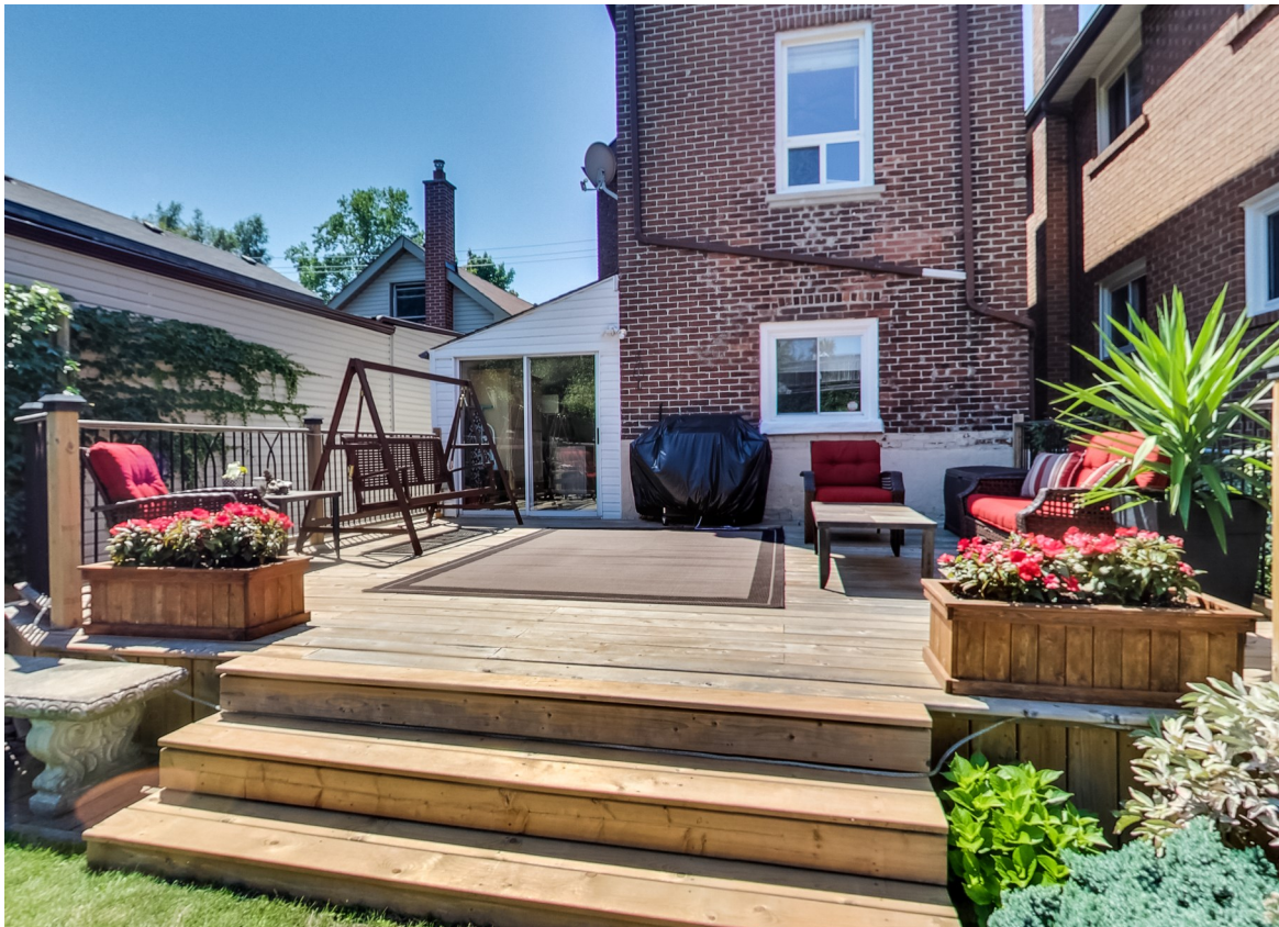
Amazing Backyard Retreat with Gorgeous Deck and Huge Shed Very deep 163 foot lot