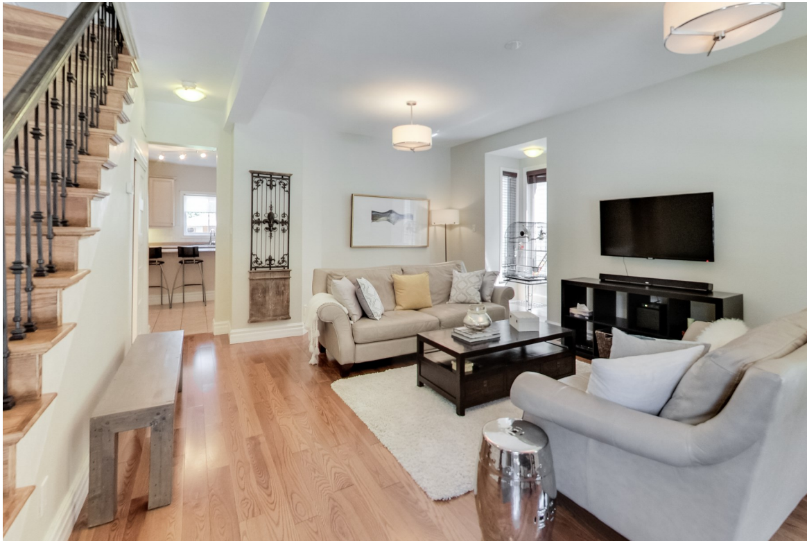
A truly spacious home with soaring high ceilings, new hardwood and new lighting