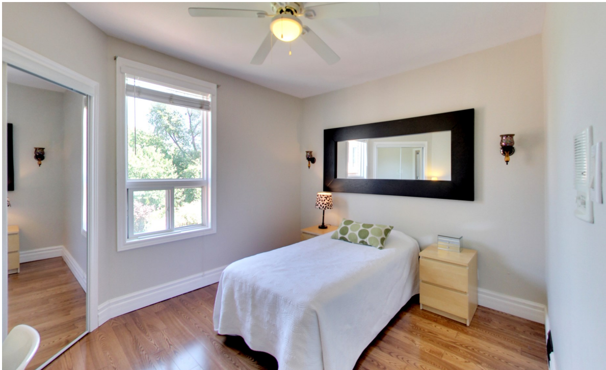
4 Bright, Large Bedrooms with Storage, including a Finished Basement with Kitchen Rough-in and Walk-out