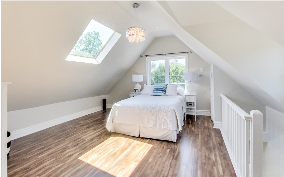
Spectacular Third Floor Master with Three Skylights