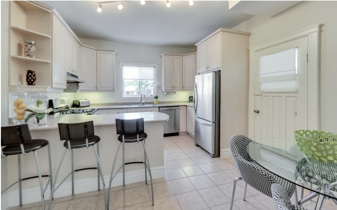
Very large Eat-in Kitchen with Brand New Appliances and Walk-out to Deck