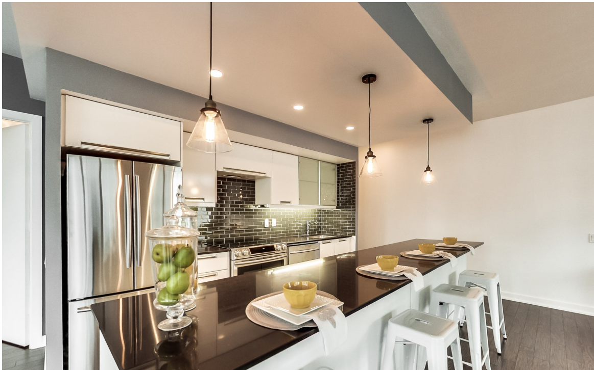
Upgraded Chef's Kitchen with Brand New Appliances