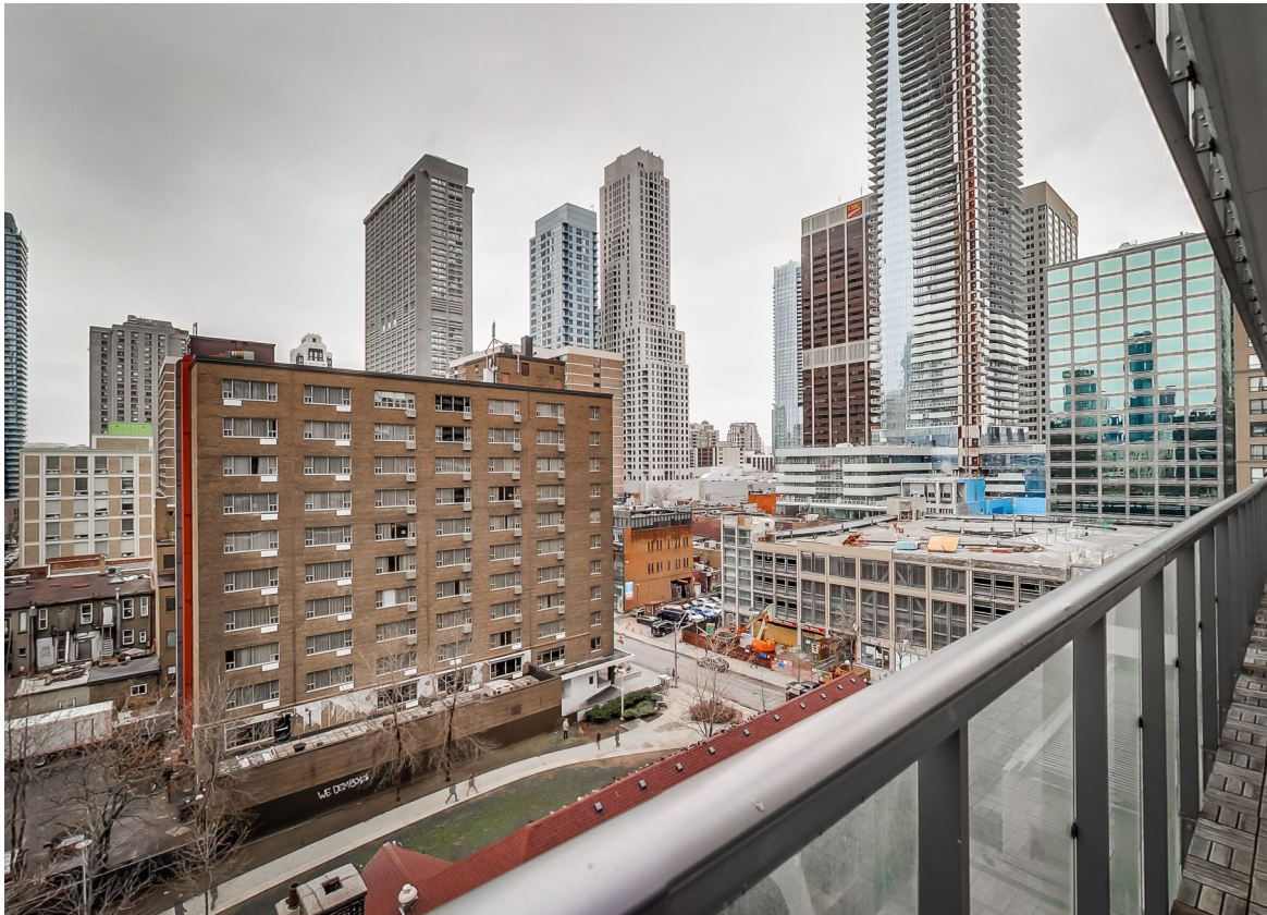
Multiple Walk-Outs with Urban Views of Bloor-Yorkville