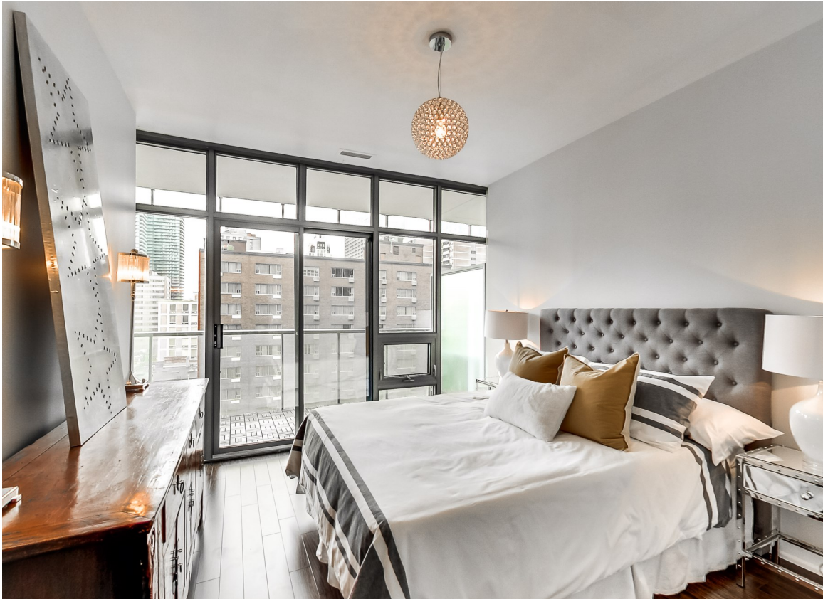
Spacious Master Bedroom with Walk-In Closet, Ensuite Bathroom Walk-Out to Wrap-Around Balcony