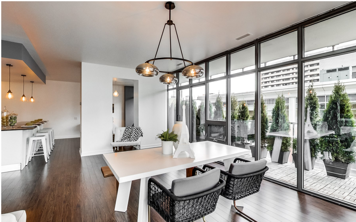
Hardwood Flooring, Smooth 9 foot ceilings, Multiple Walk-Outs to Wrap-Around Balcony