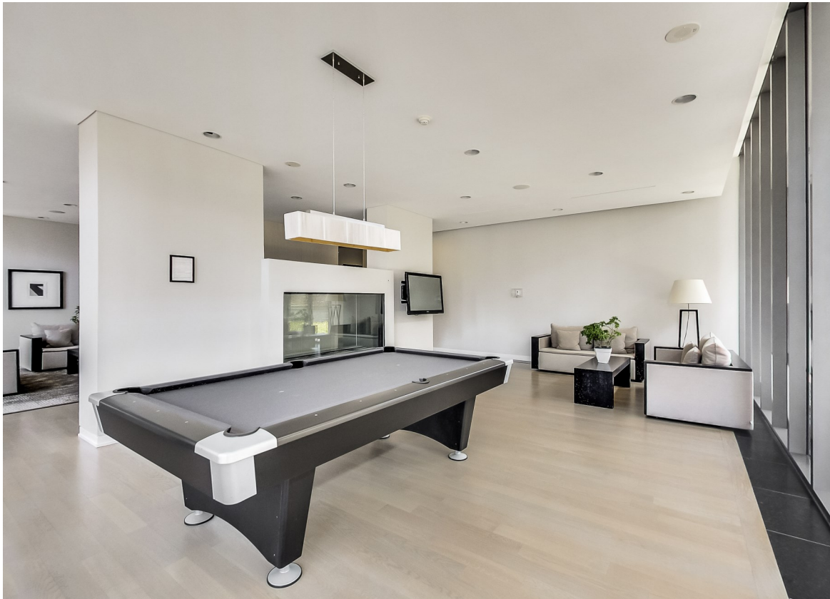
5 Star Building Amenities: Outdoor Pool, Billiards, BBQs, Gym, Guest Suites, Yoga Studio, Media Room, Party Room with Catering Kitchen & Meeting Rooms