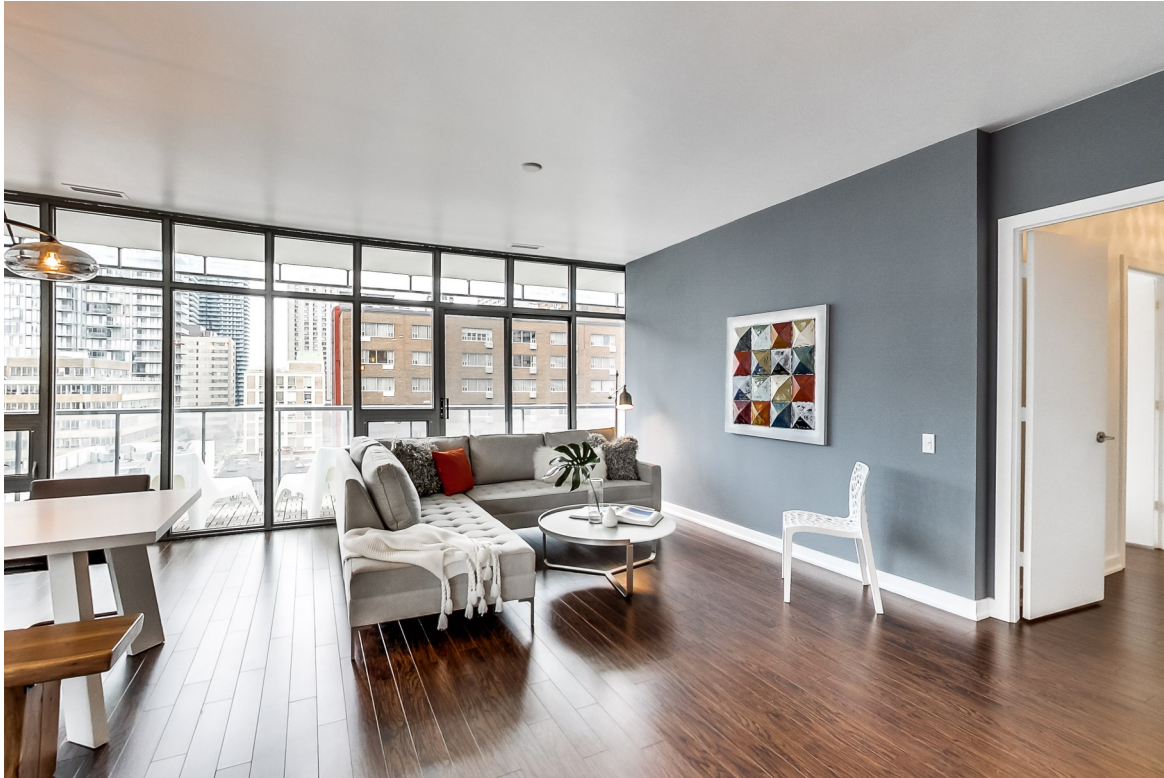
Incredibly Spacious & Modern Open-Concept Living Area, Ideal for Entertaining