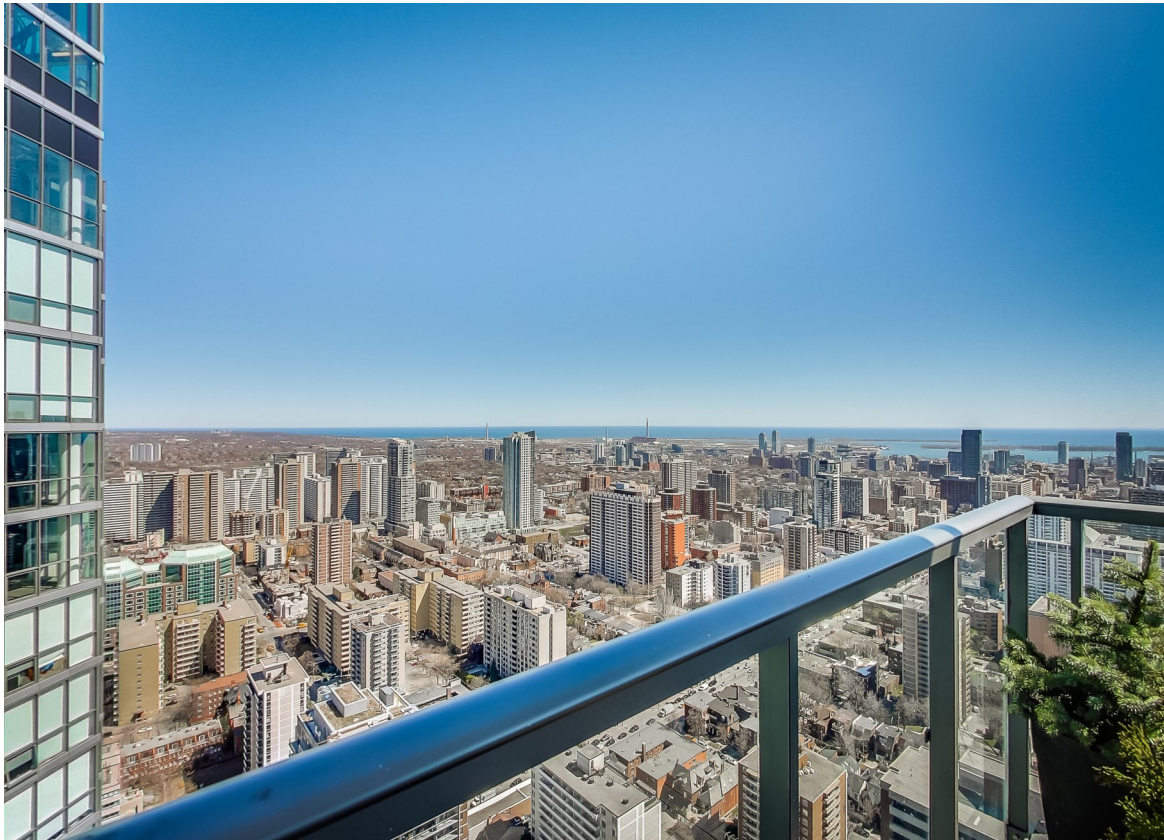
Stunning South East Views from a 436 sq.ft Wrap-around Balcony