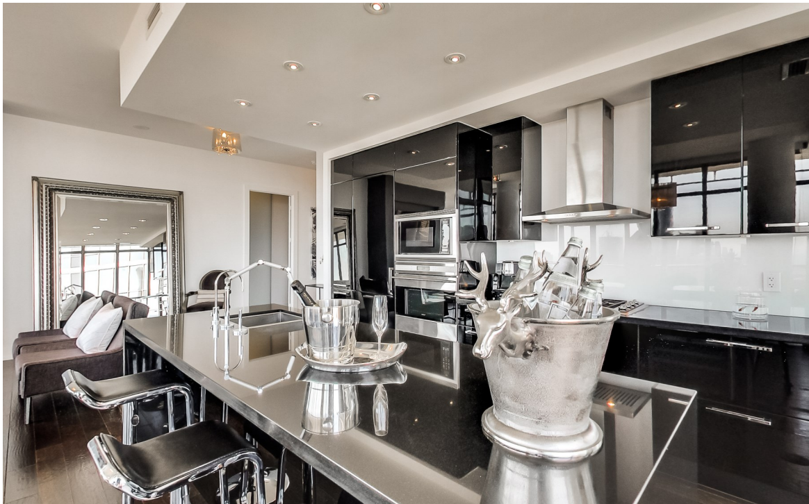
Spectacularly Stylish & Upgraded Chef's Kitchen