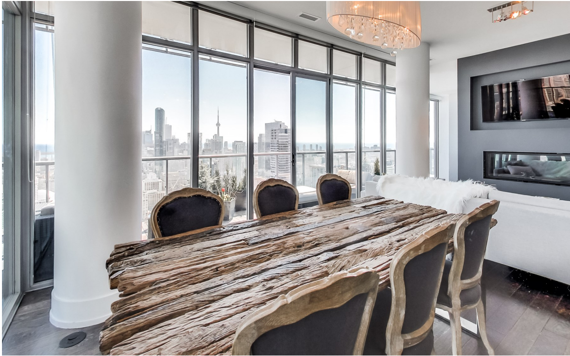
Elegant Formal Dining - Hardwood Floors Throughout with Floor to Ceiling Windows