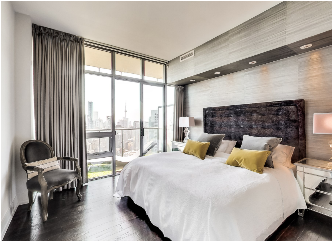
2 Large Bedrooms & Spa-like Ensuite