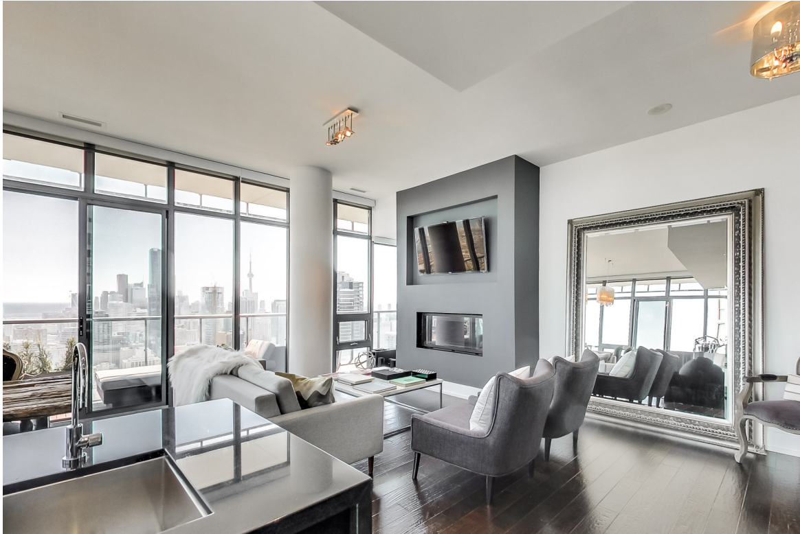
Opulent, Lavish & Modern Open-Concept Living Area