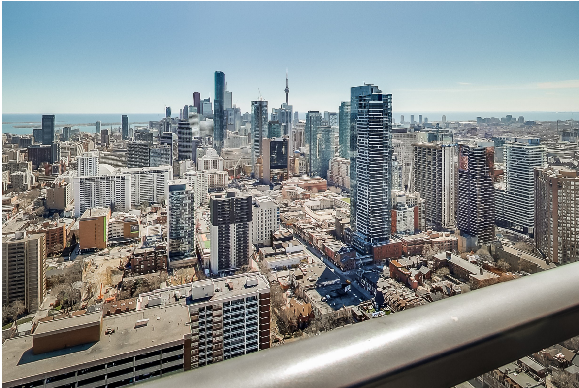
Modern & Sleek Tower with Grand Entrance