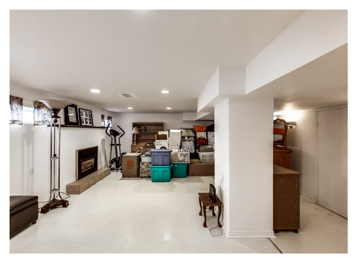
Separate Basement Easy-to-Make In-Law Suite with its own Side Entrance