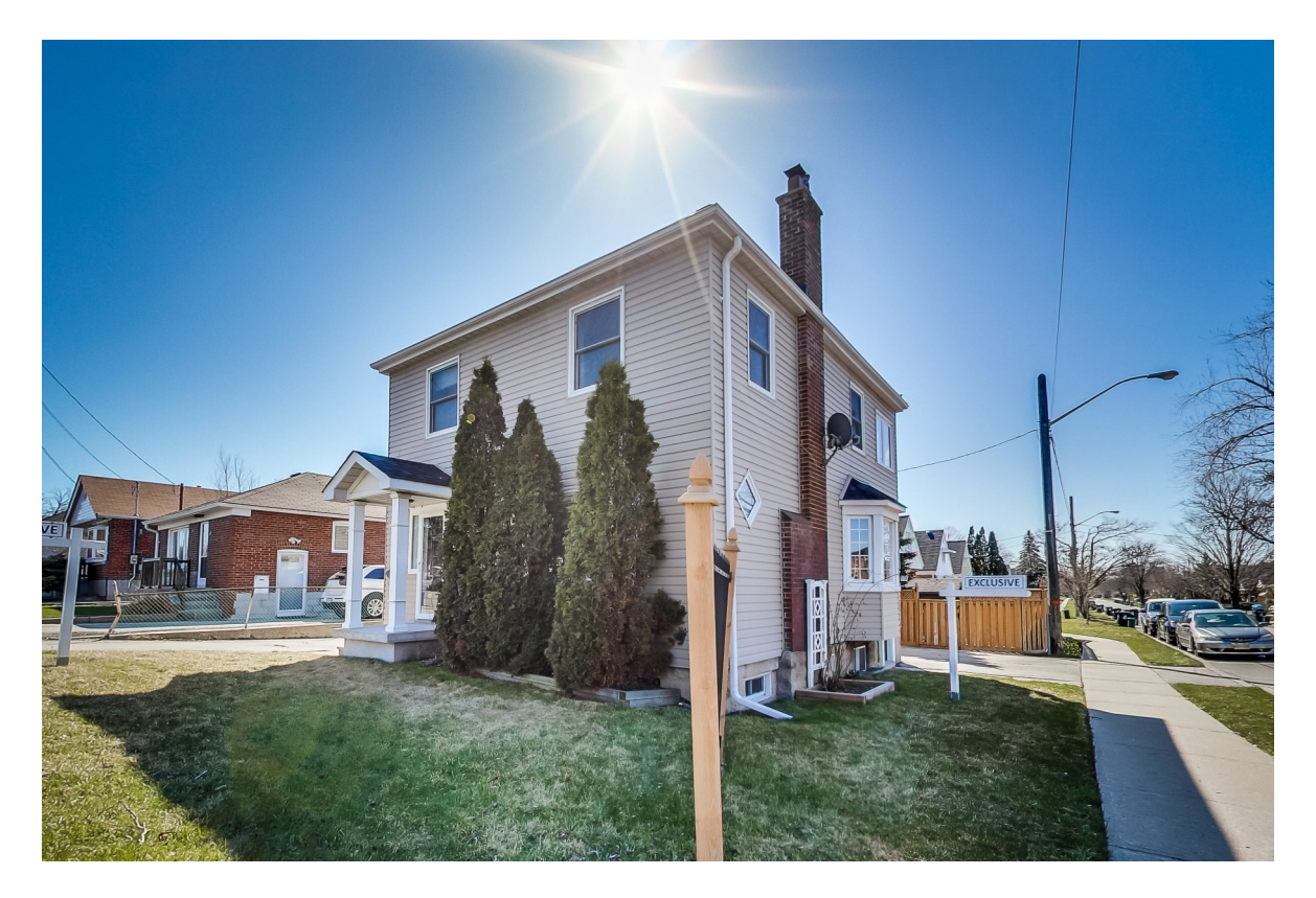
Beautiful, High Quality Renovations, Pristine Condition, Detached Family Home 3+1 Bedrooms, 2 Driveways for 4 or More Cars