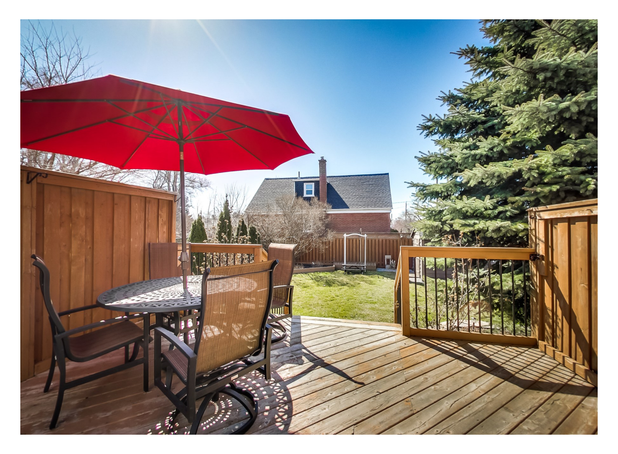
Large, Quiet, Fenced-in Backyard