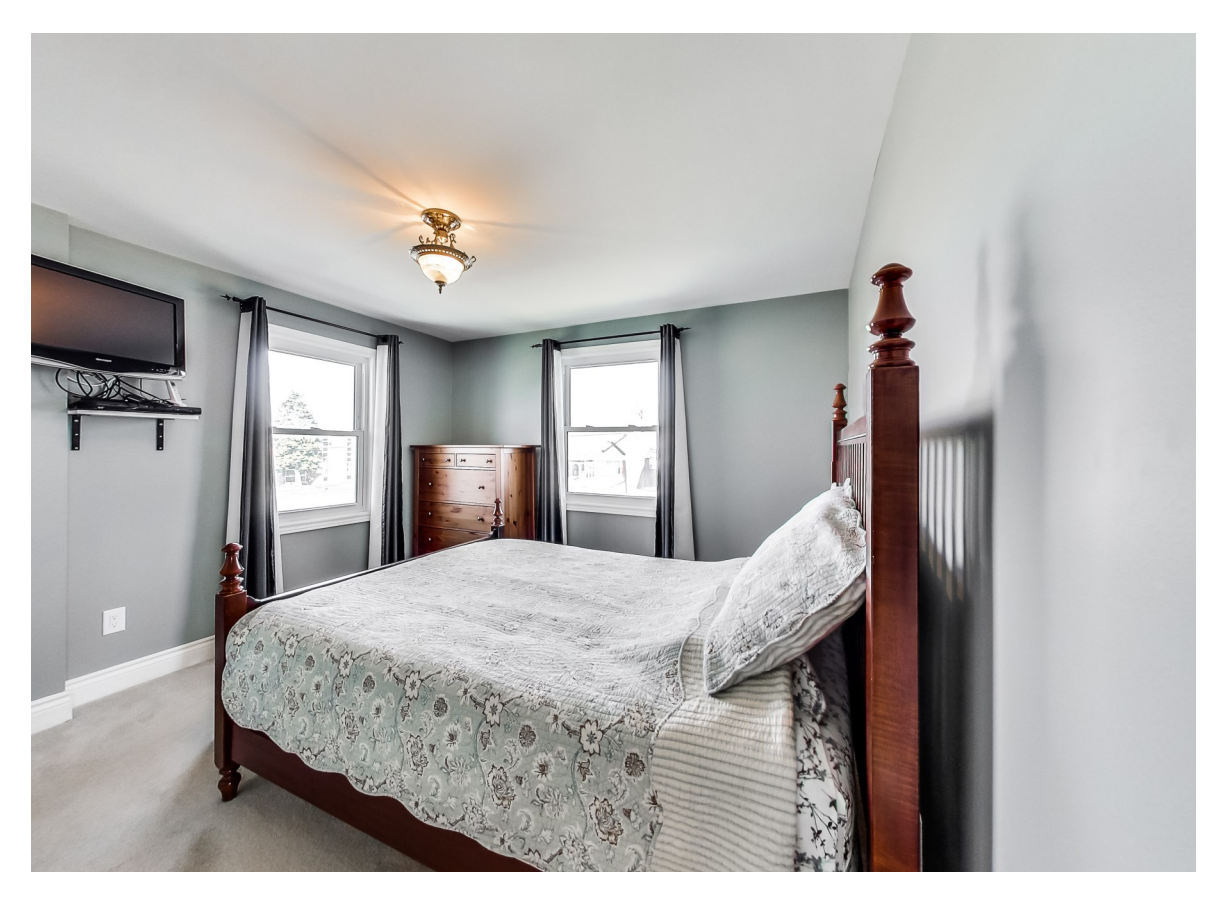
3 Large Bedrooms with lots of Closet Space & A Bonus Walk-In Hall Closet