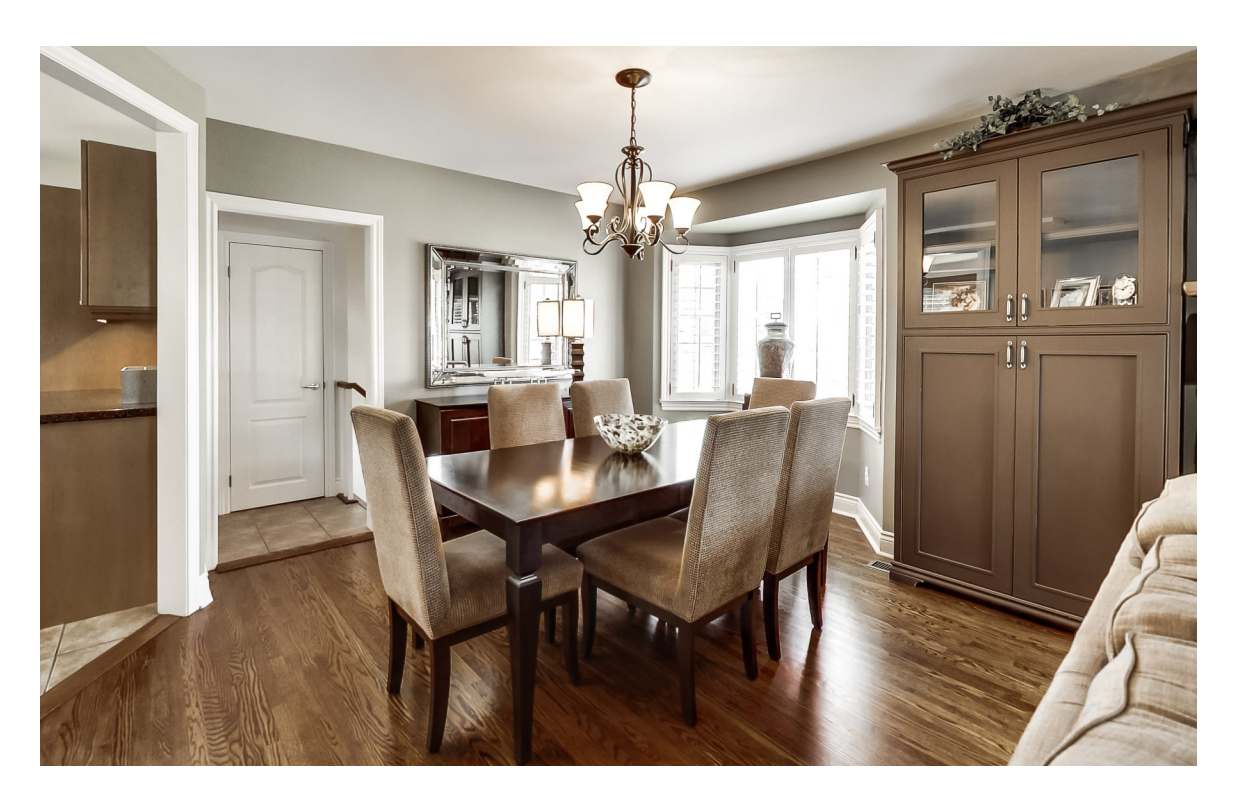
Elegant Formal Dining - Hardwood Floors Throughout