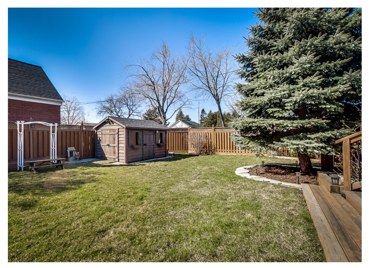
Walk-Out to Deck & a Private, Landscaped Backyard Paradise Extra large 43 x 111 ft lot