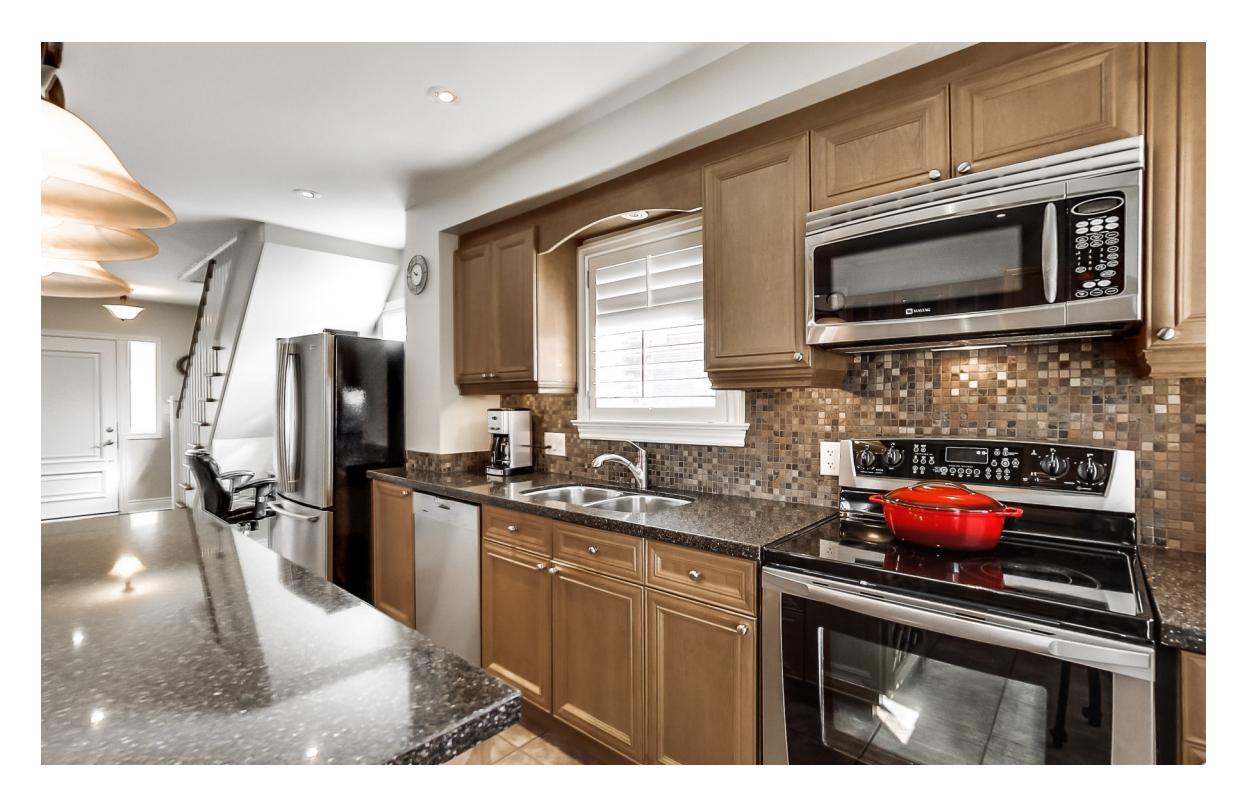
Spectacular Chef's Kitchen with Island & Quartz Countertops