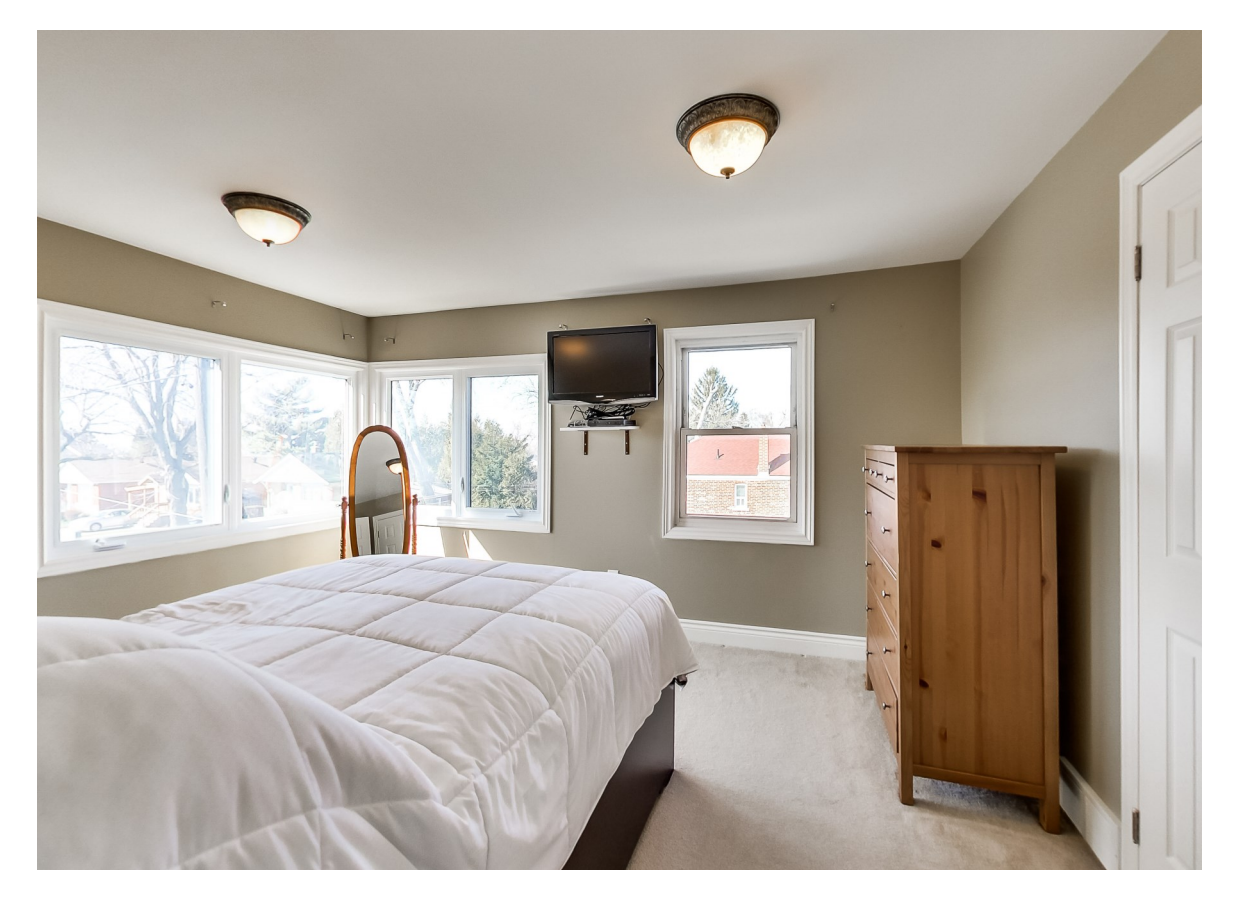
Bright & Beautiful Master Bedroom