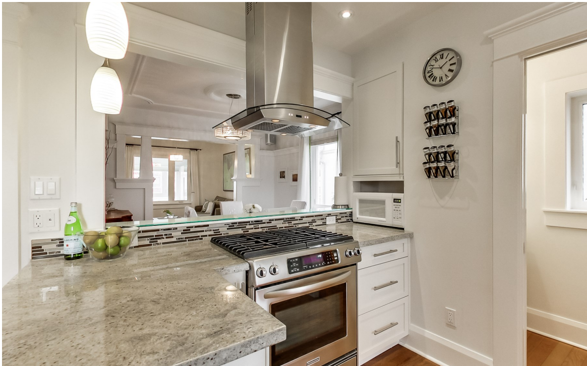
Spectacular Chef's Kitchen with 4 Burner Gas Cook-Top