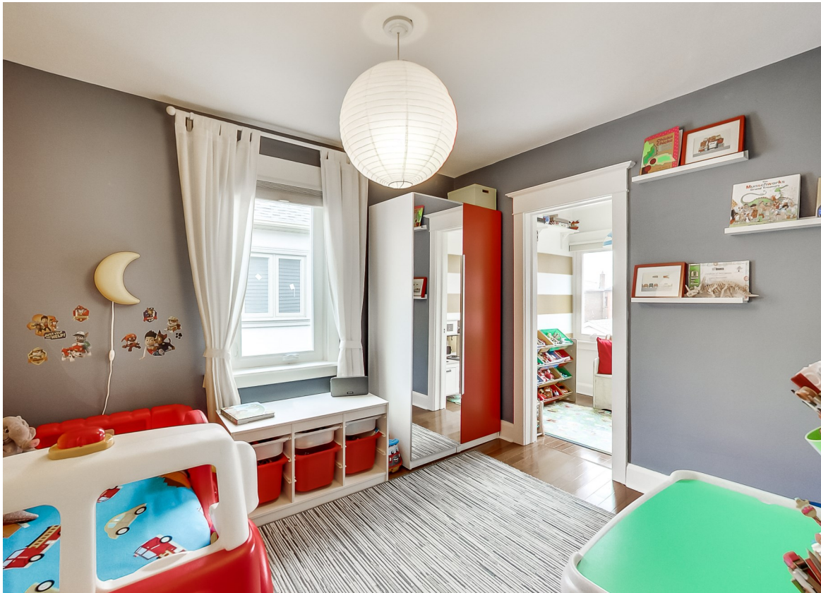
3 Large Bedrooms Plus a Bonus Sitting or Play Area Drop-Down Ladder Access to an Additional 3rd Floor Room