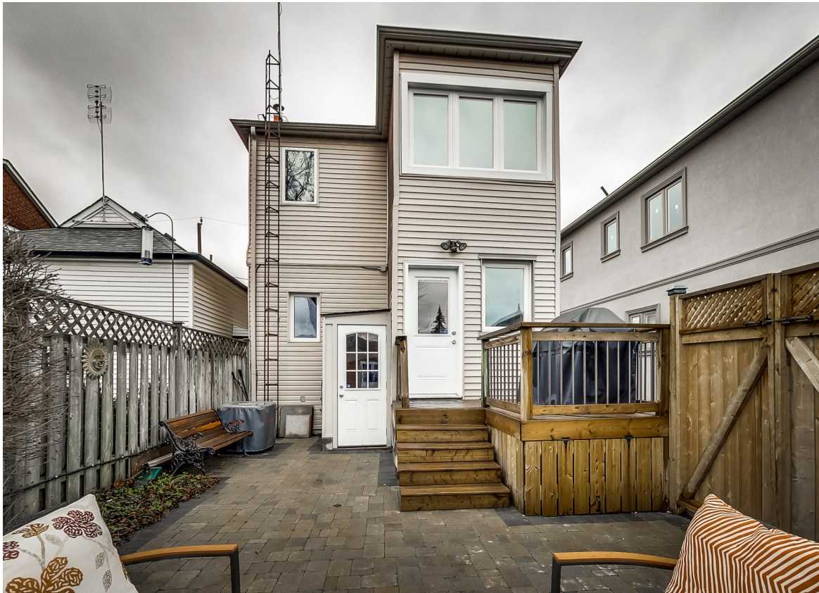
Large, Quiet, Fenced-in Backyard