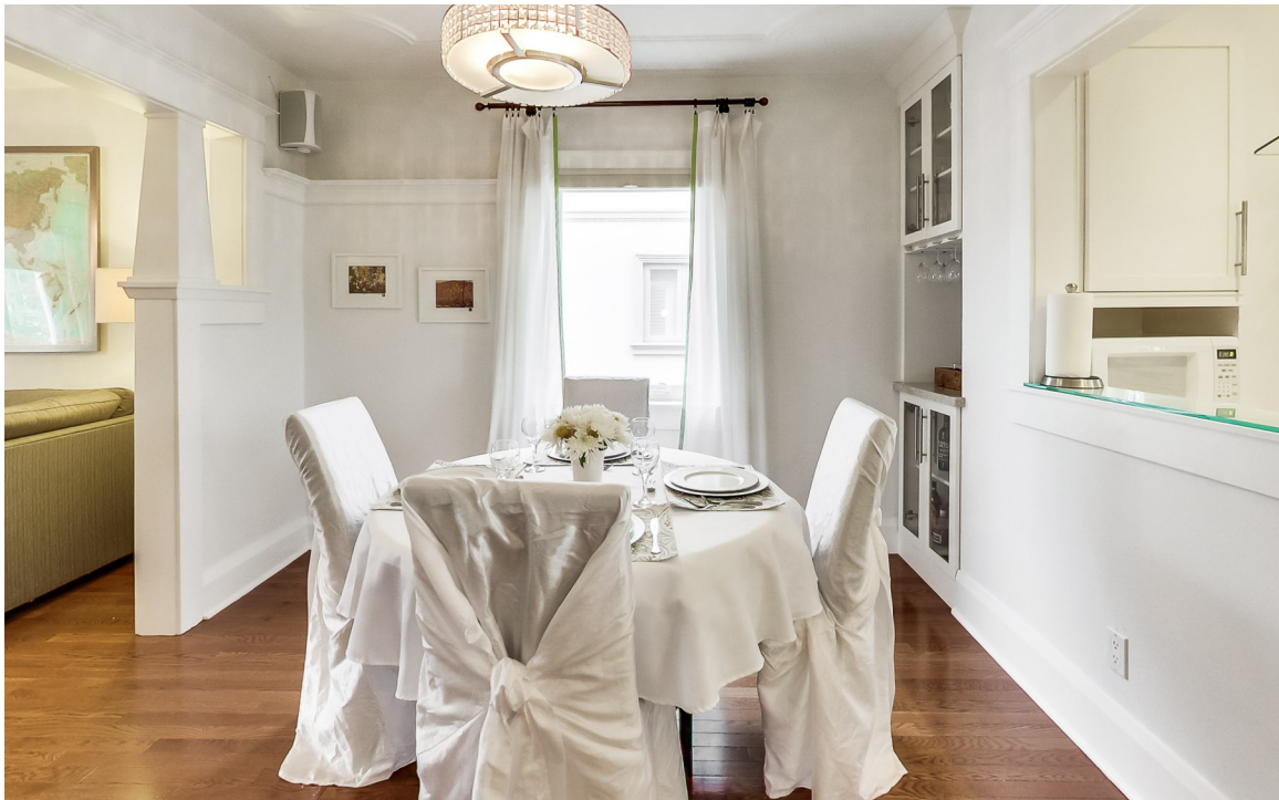
Elegant Formal Dining - Hardwood Floors Throughout