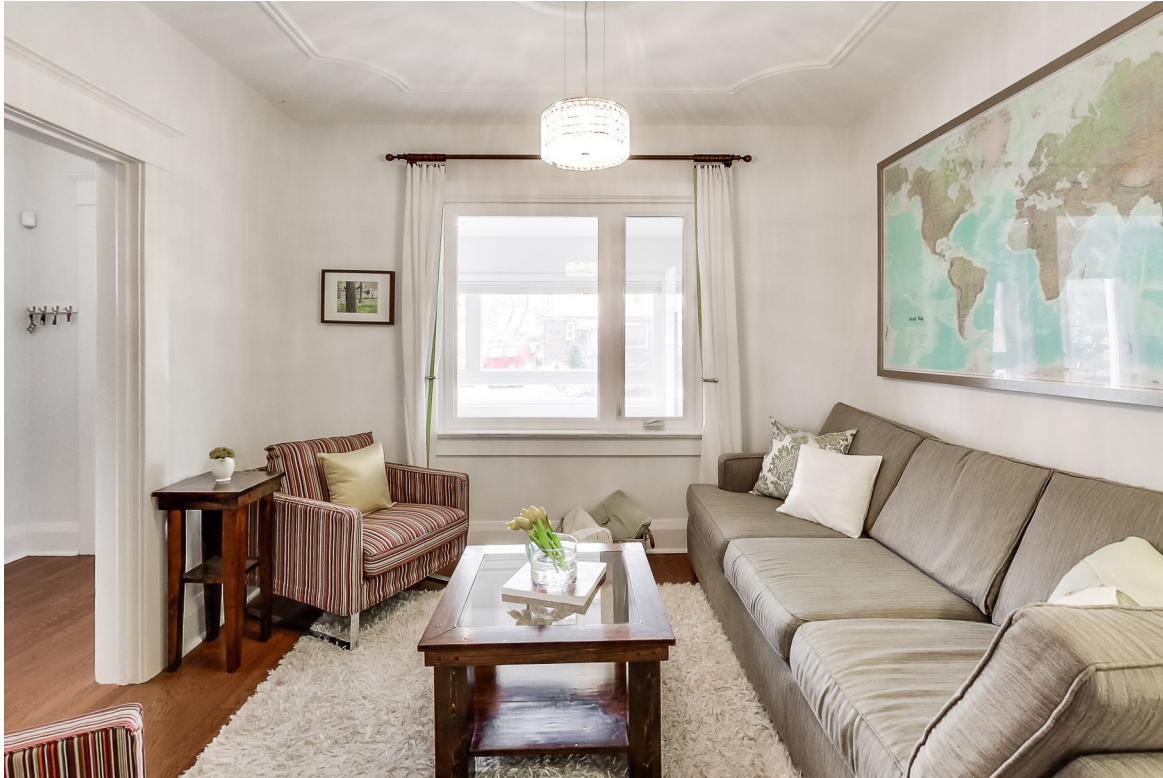
Modern Open-Concept Living Area