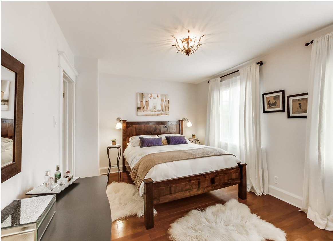
Bright & Beautiful Master Bedroom