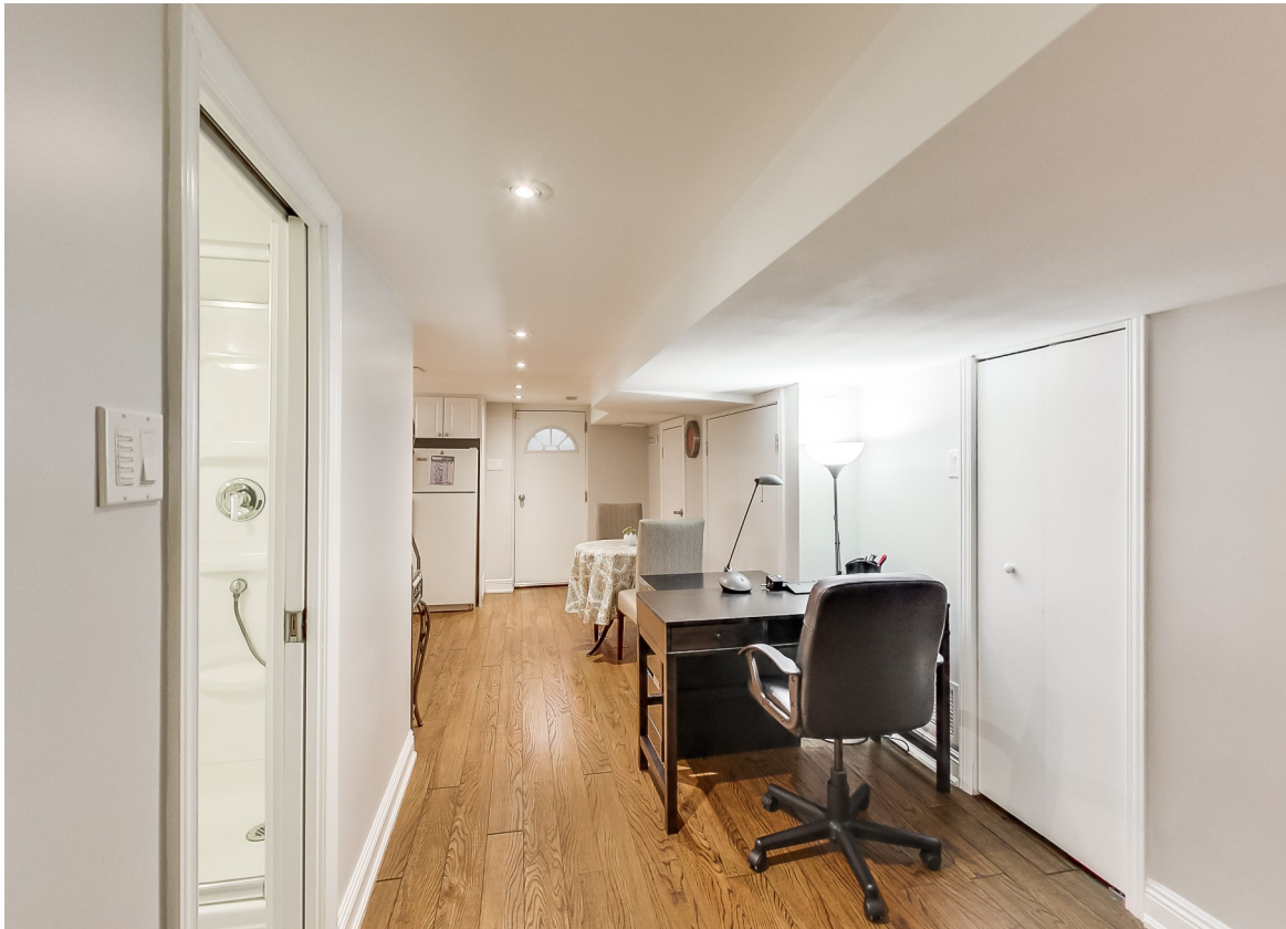
Separate Basement In-Law Suite with its Own Private Entrance