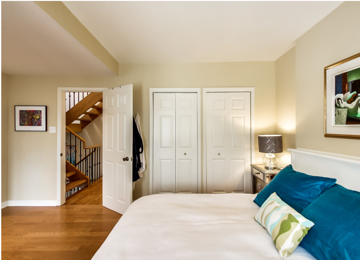
Three Spacious Bedrooms with Lots of Storage Modern and Stylish 4-Piece Bathroom with Skylight on 2nd Floor