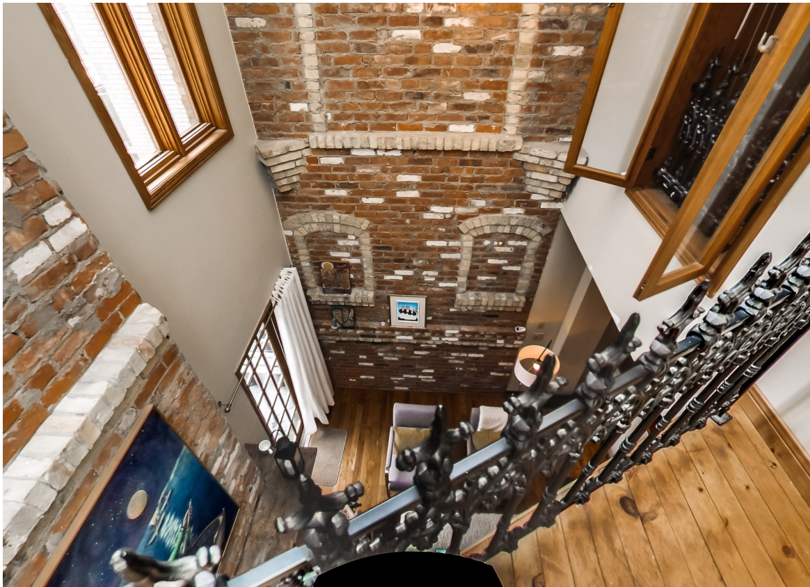
Bonus Loft Area with Skylights for Home Library or Office