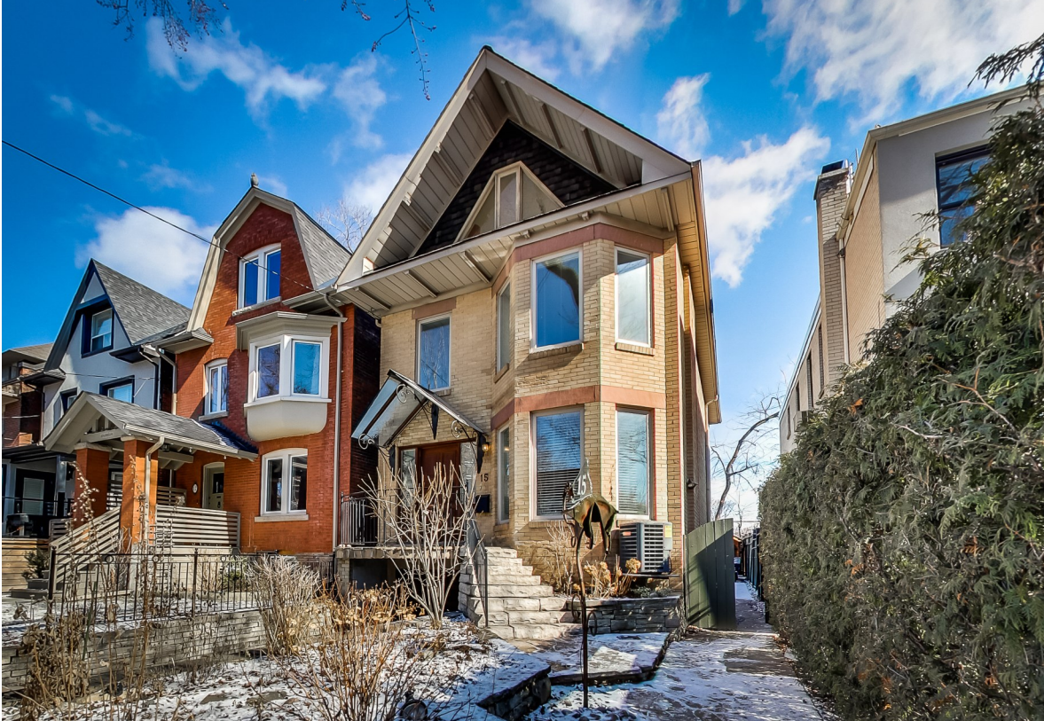
A Spacious, Detached Solid Brick Beauty on a Quiet Cul-de-Sac Close to Schools, Subway, High End Retail Stores & Restaurants