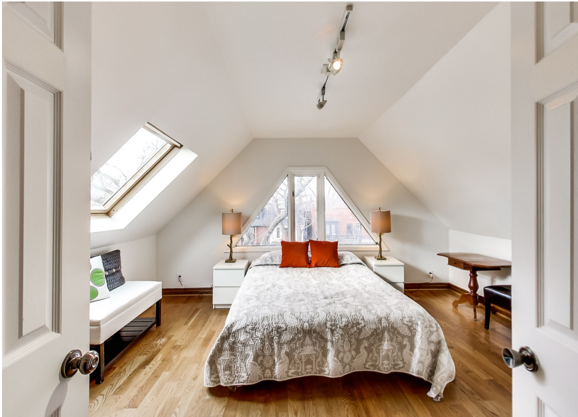
Impressive 3rd Floor Master Suite with 4 Piece Bath & Dressing Area Could Become an Ideal Home Office or Children's Play Room