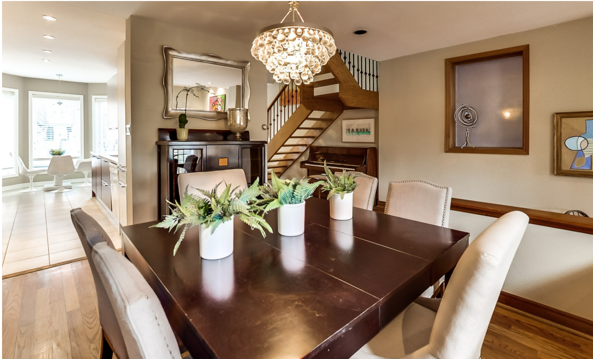
Open-Concept Formal Dining