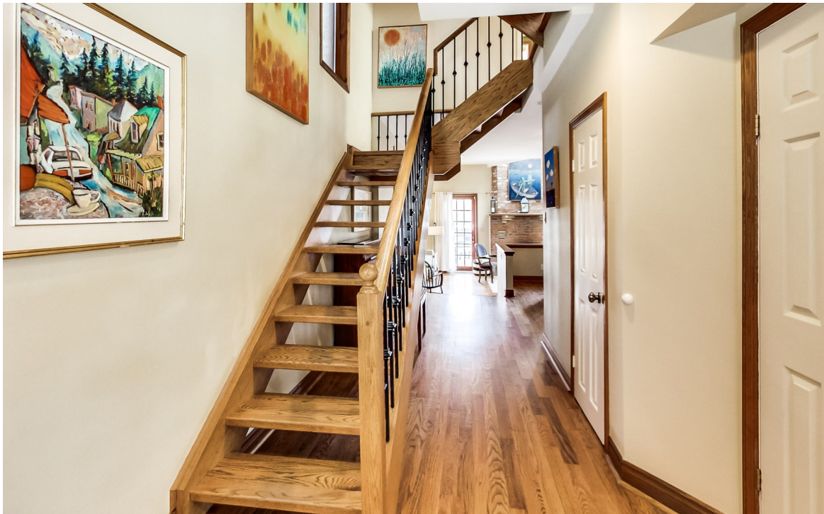
Grand & Elegant Foyer - Bright & Modern Eat-In Scavolini Kitchen with Heated Floor Newer, Built-In Appliances (2010)