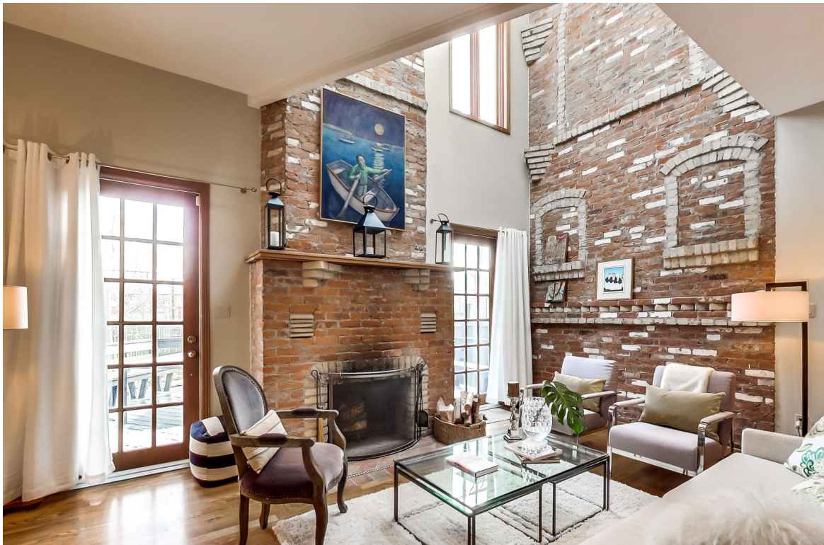
Sunken Living Room with Double-Sided Wood-Burning Fireplace Soaring High Windows - Elegant Exposed Brick - Walk-Out to Back Deck