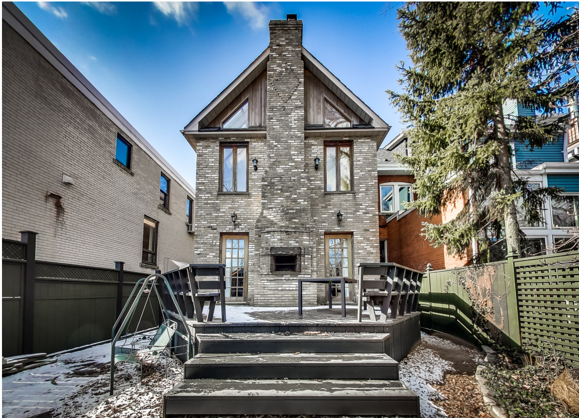
Private Backyard Oasis with Wood-Burning Fireplace Backing onto Midtown Toronto's Historic Cottingham Tennis Club