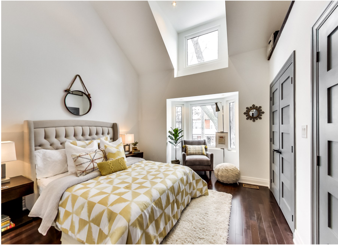
Bright, Impressive & Inviting Master Bedroom Approx. 13' Spectacular Vaulted Ceiling and Loads of Extra Storage