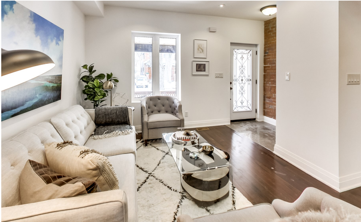
A Wonderfully Open-Concept Main Floor with Brand New Hardwood Flooring Nearly 60 Pot Lights Throughout the House