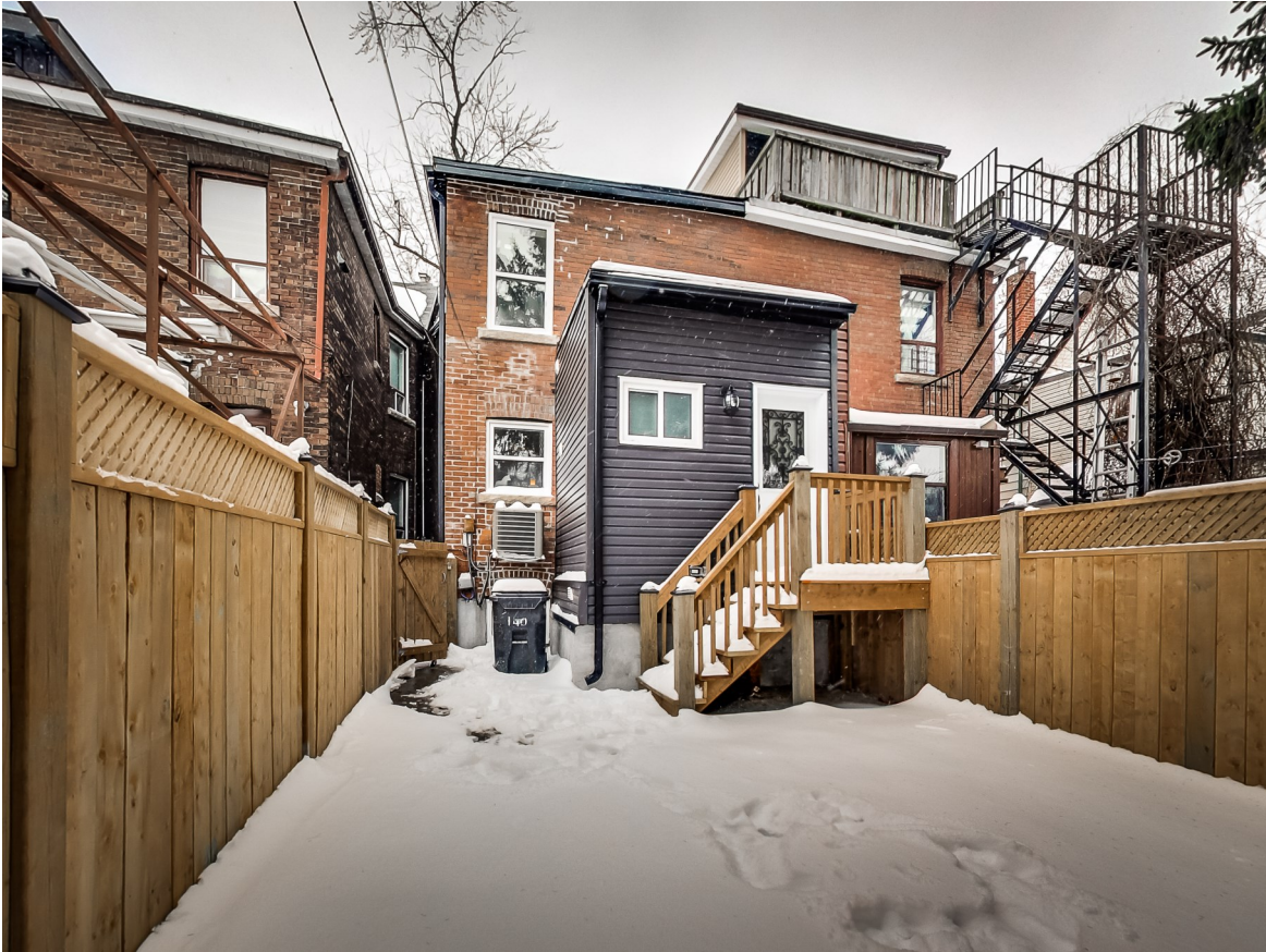
Private Fenced-in Backyard