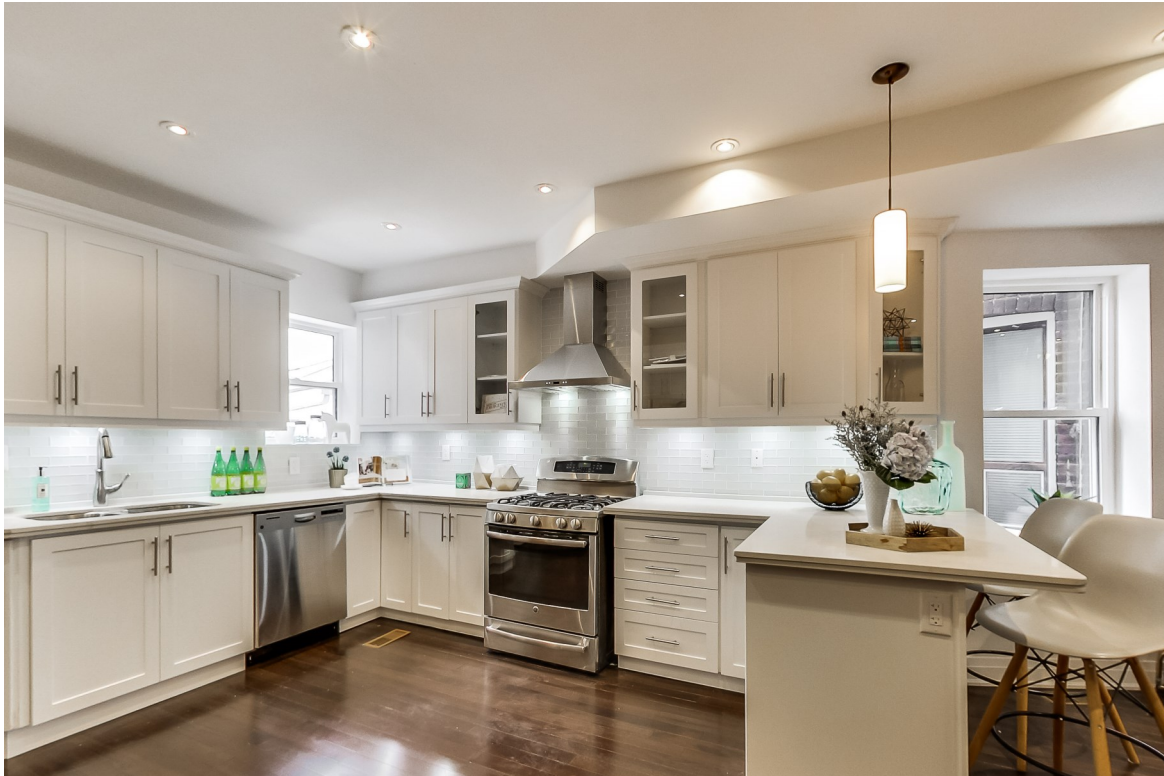
Stunning chef's Kitchen with Gas Stove and Glass Brick-Style Backsplash