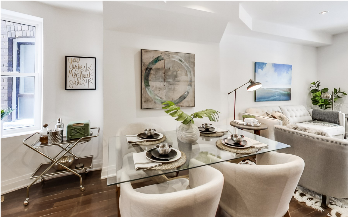
Open-Concept Formal Dining