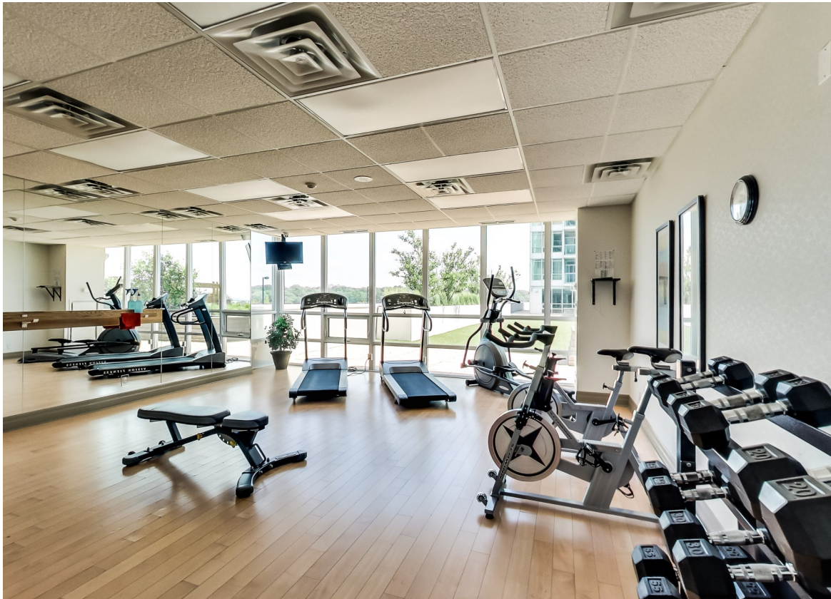
Outstanding Amenities in a Beautifully Maintained Building