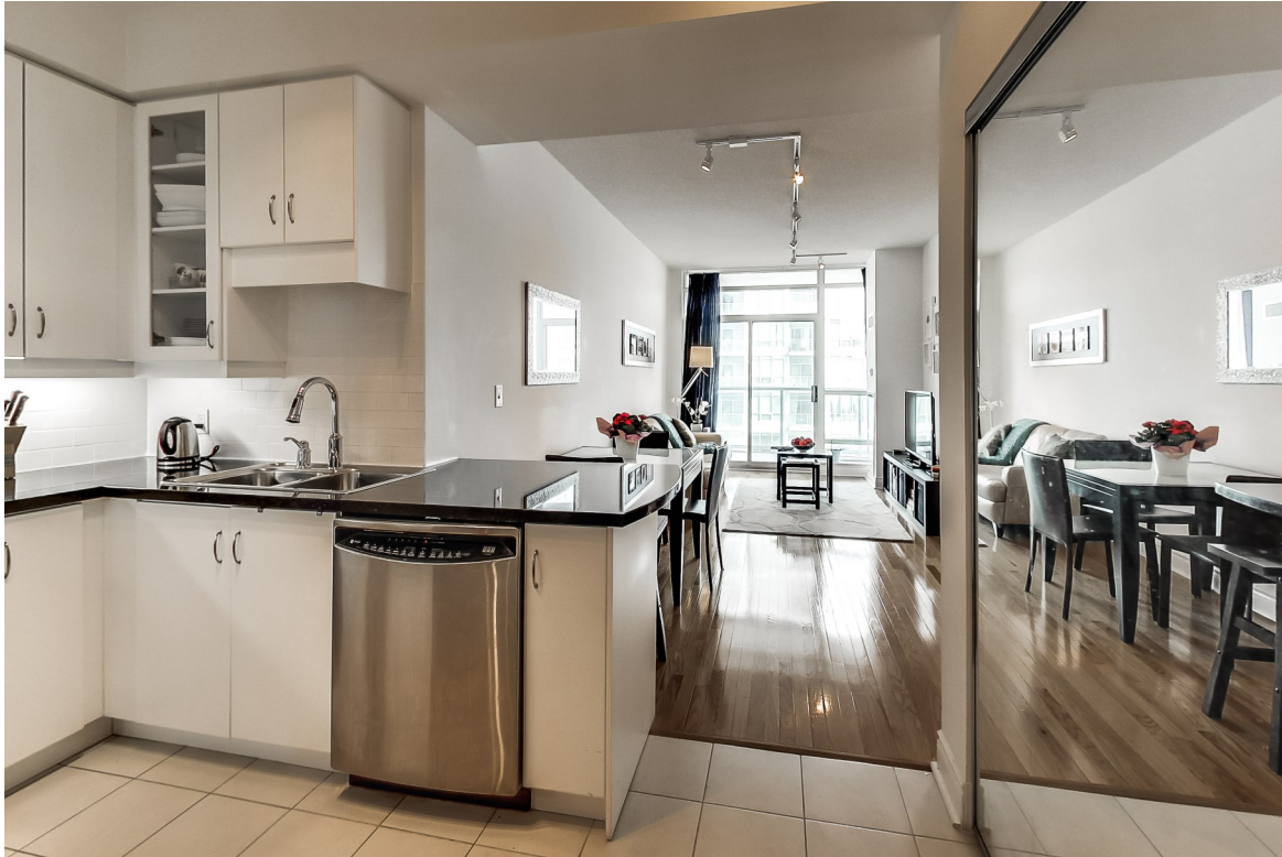
Wonderful Open-Concept and a Very Functional Layout with 9' Ceilings