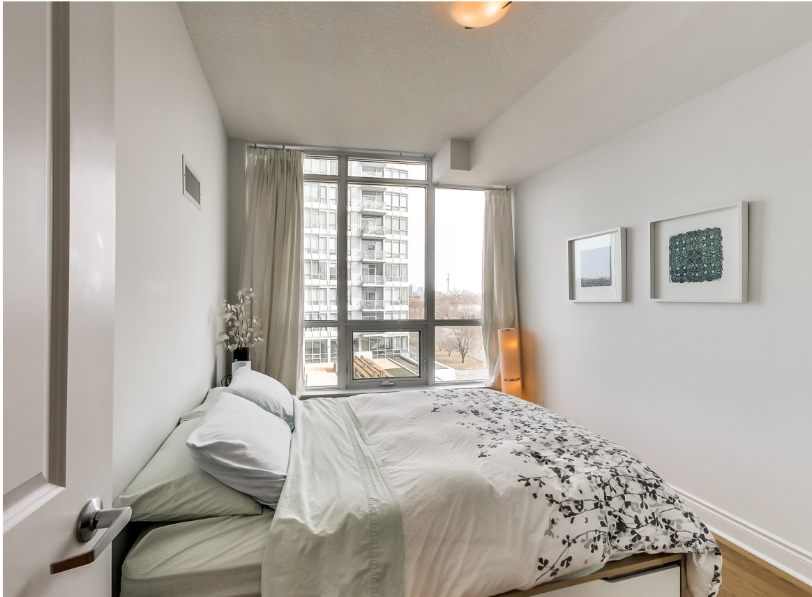
Master Bedroom with Lake Views from a Private Balcony