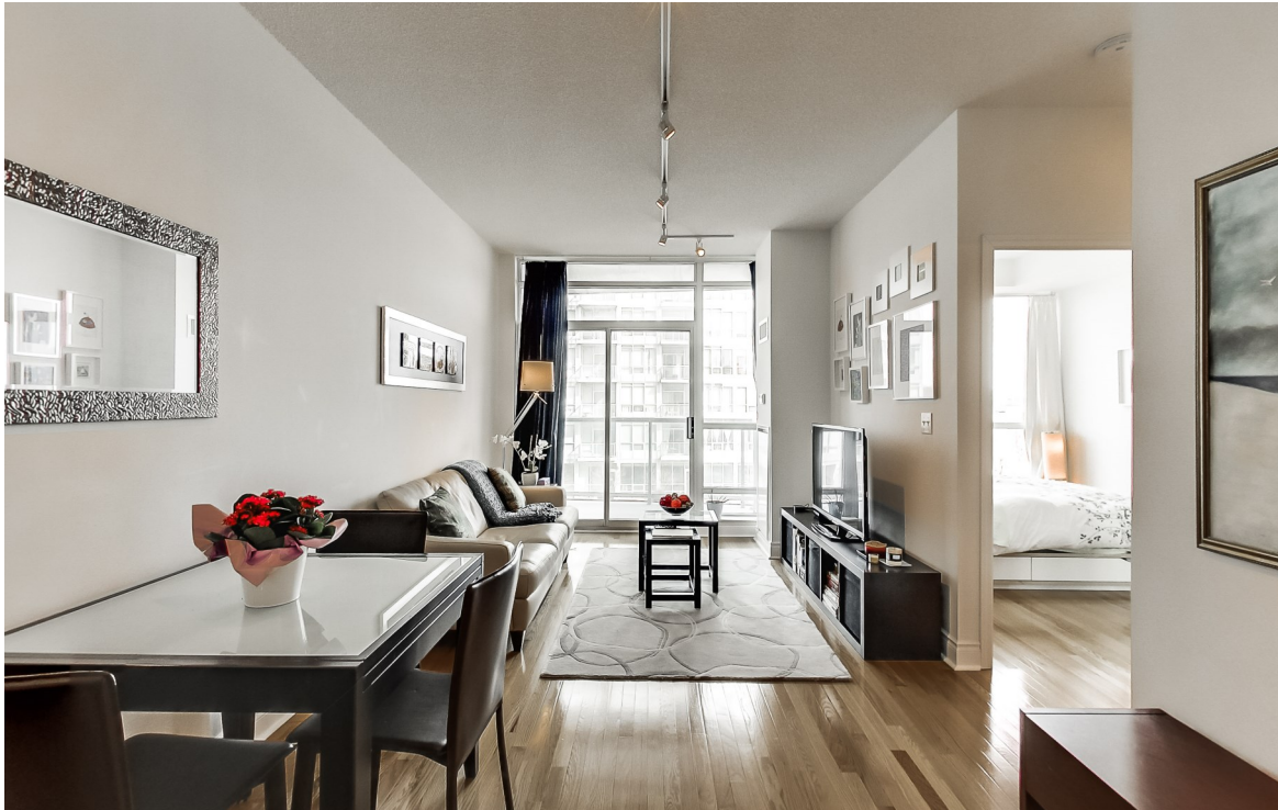
Enjoy the View From Floor to Ceiling Windows