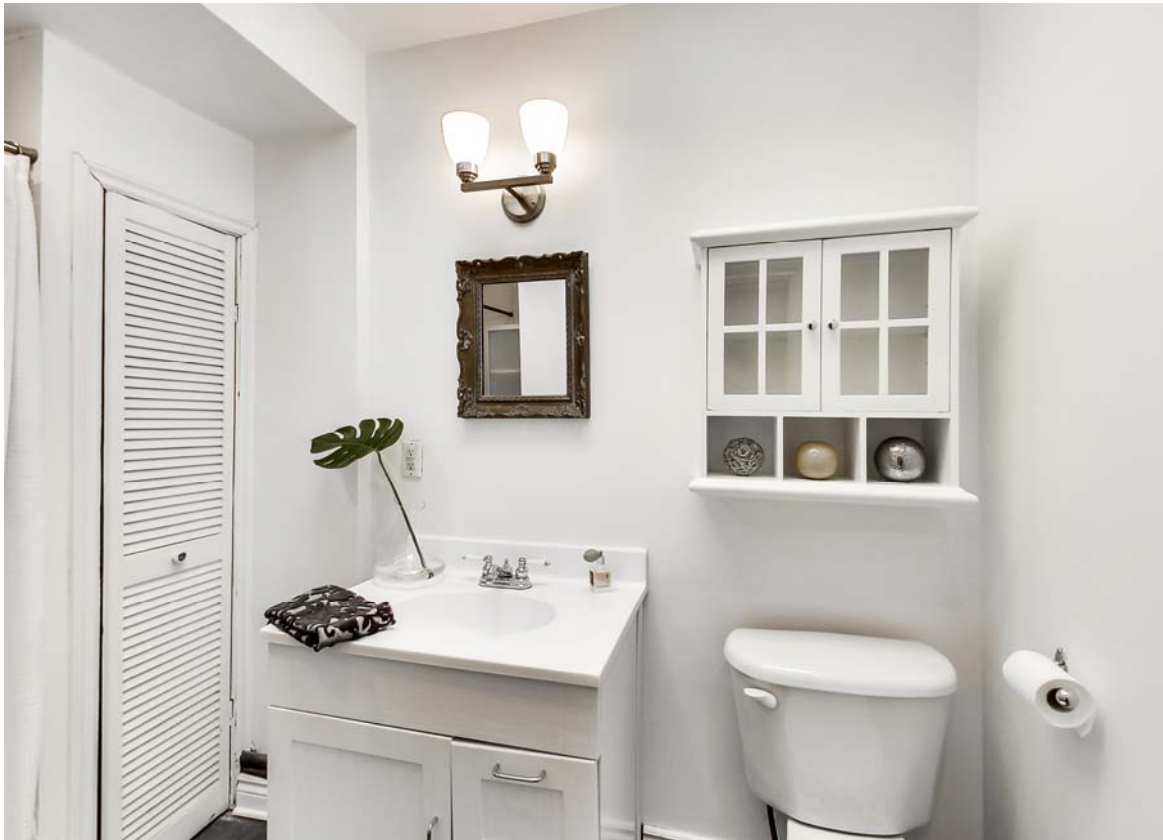
Bright white bathroom with skylight and large deck in the fenced-in backyard