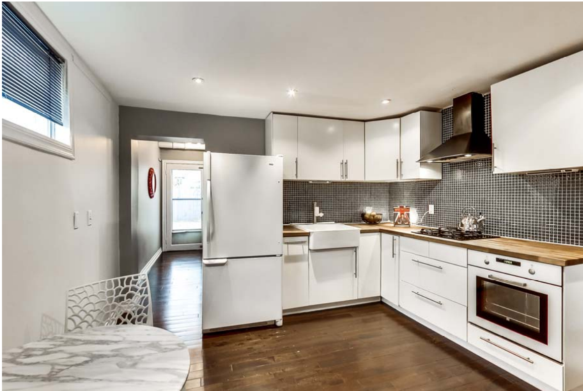
Large eat-in kitchen