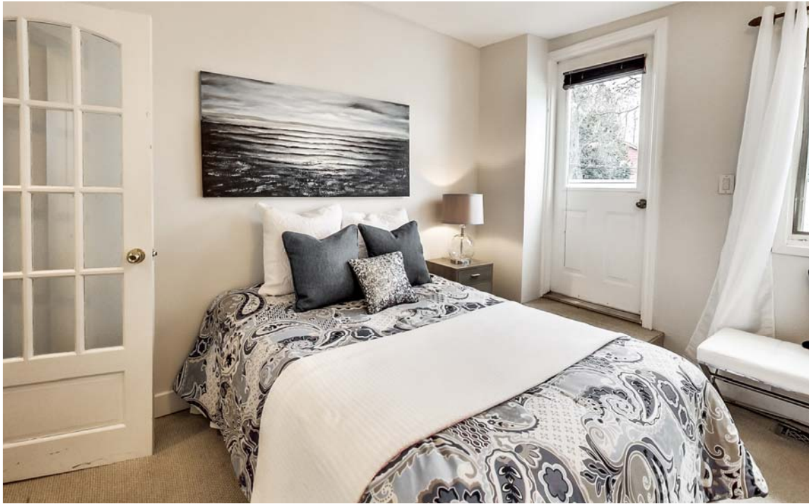
The Master bedroom offers a huge balcony up in the trees that will become your favourite spot