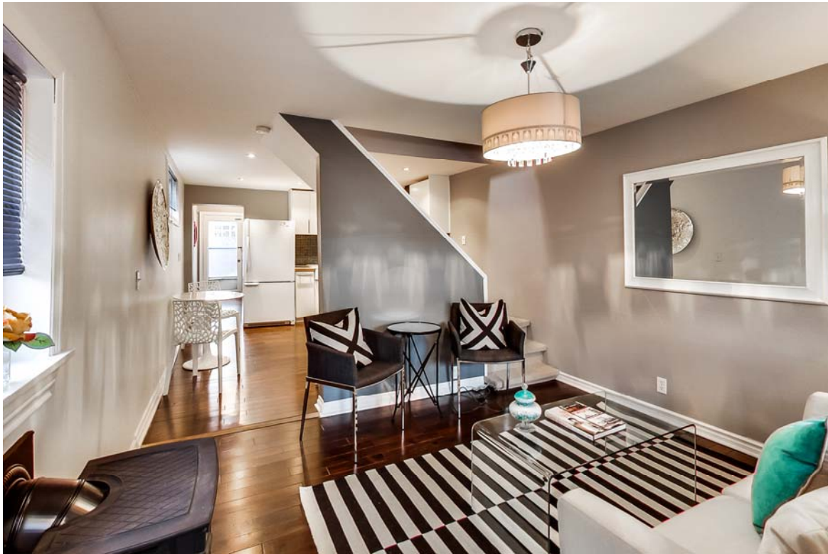
A wonderfully open-concept main floor welcomes you with a gas fireplace