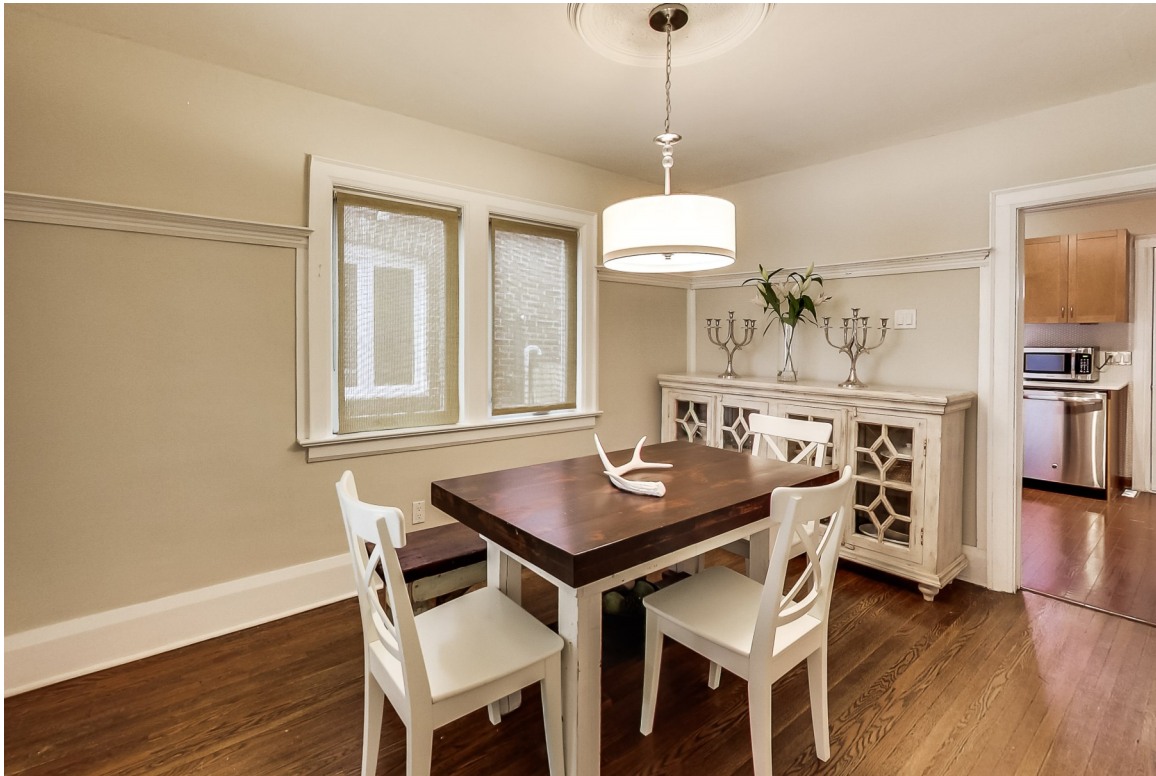
Separate formal dining room