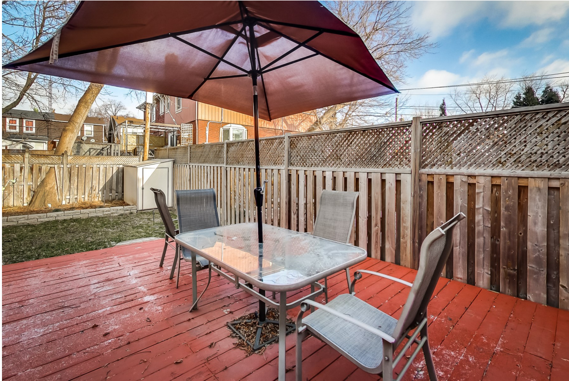
A fabulous fenced-in back yard with large deck