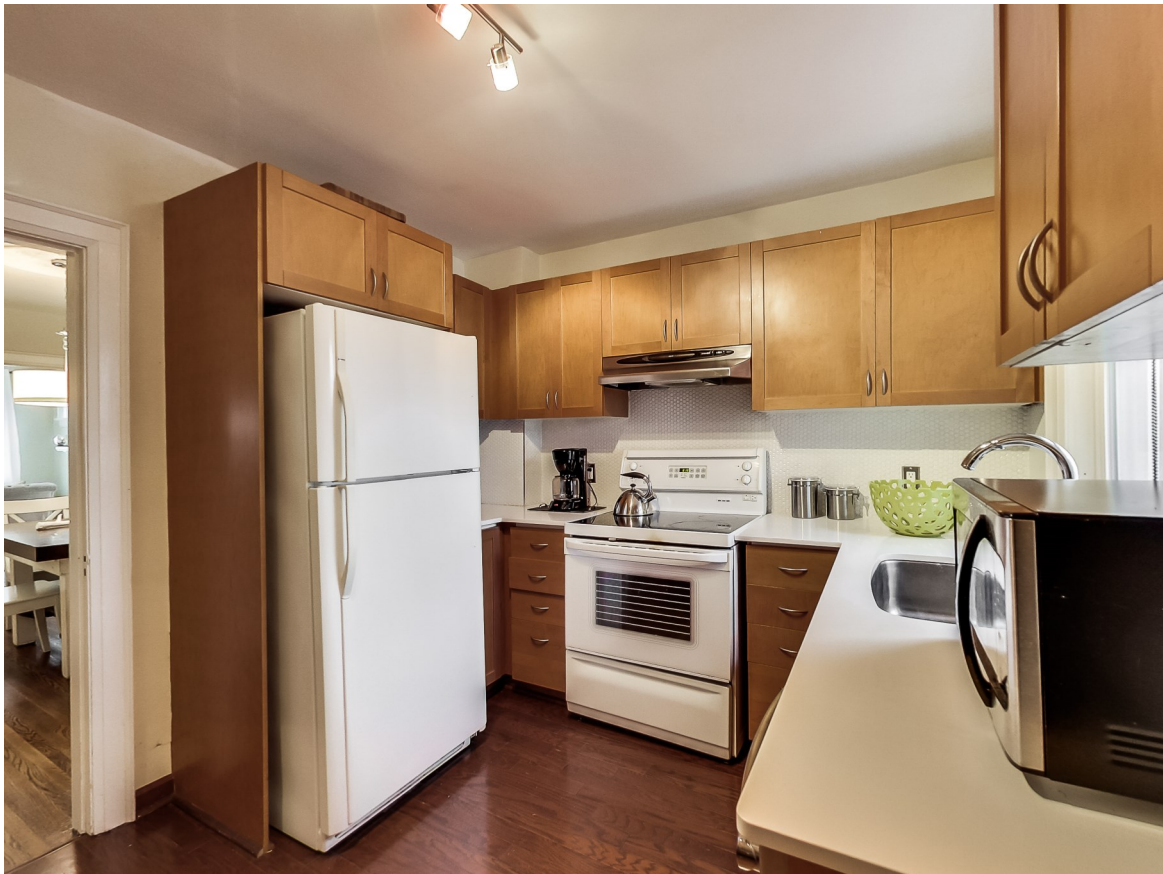
Large eat-in kitchen with walkout to back porch and deck