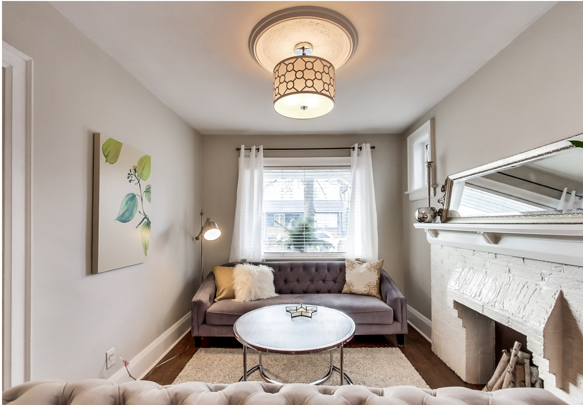
Bright living room overlooking front porch