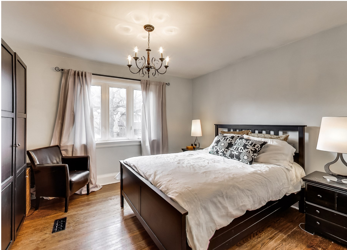
Large master bedroom with new windows