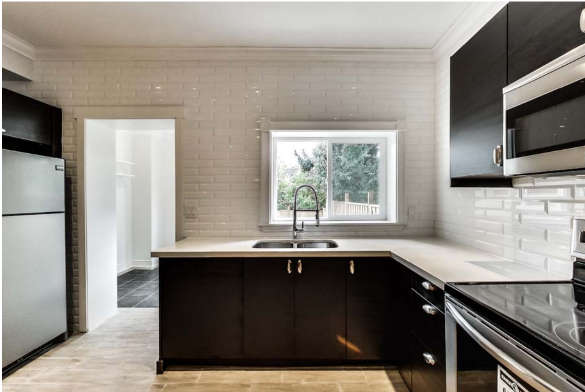
Ideal for Parties & Dinners Prepared in the Sleek New Kitchen