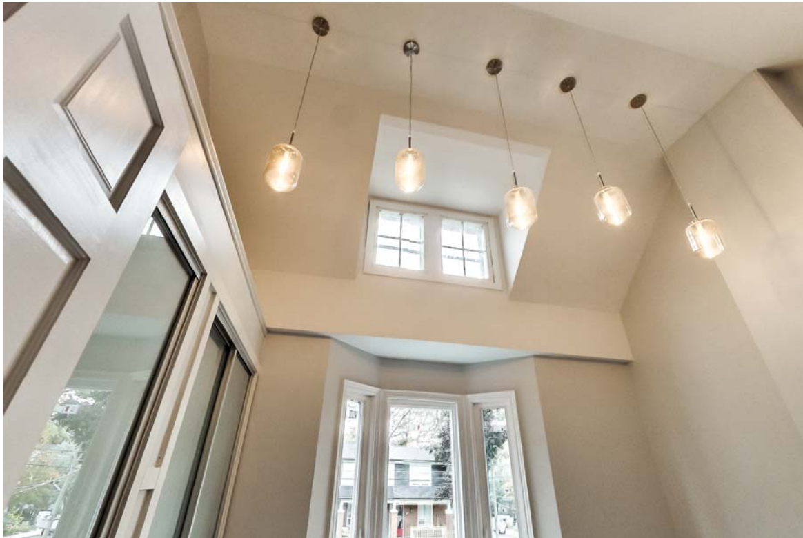
Spacious Master Bedroom with Cathedral Ceiling and Custom Built-In Closets