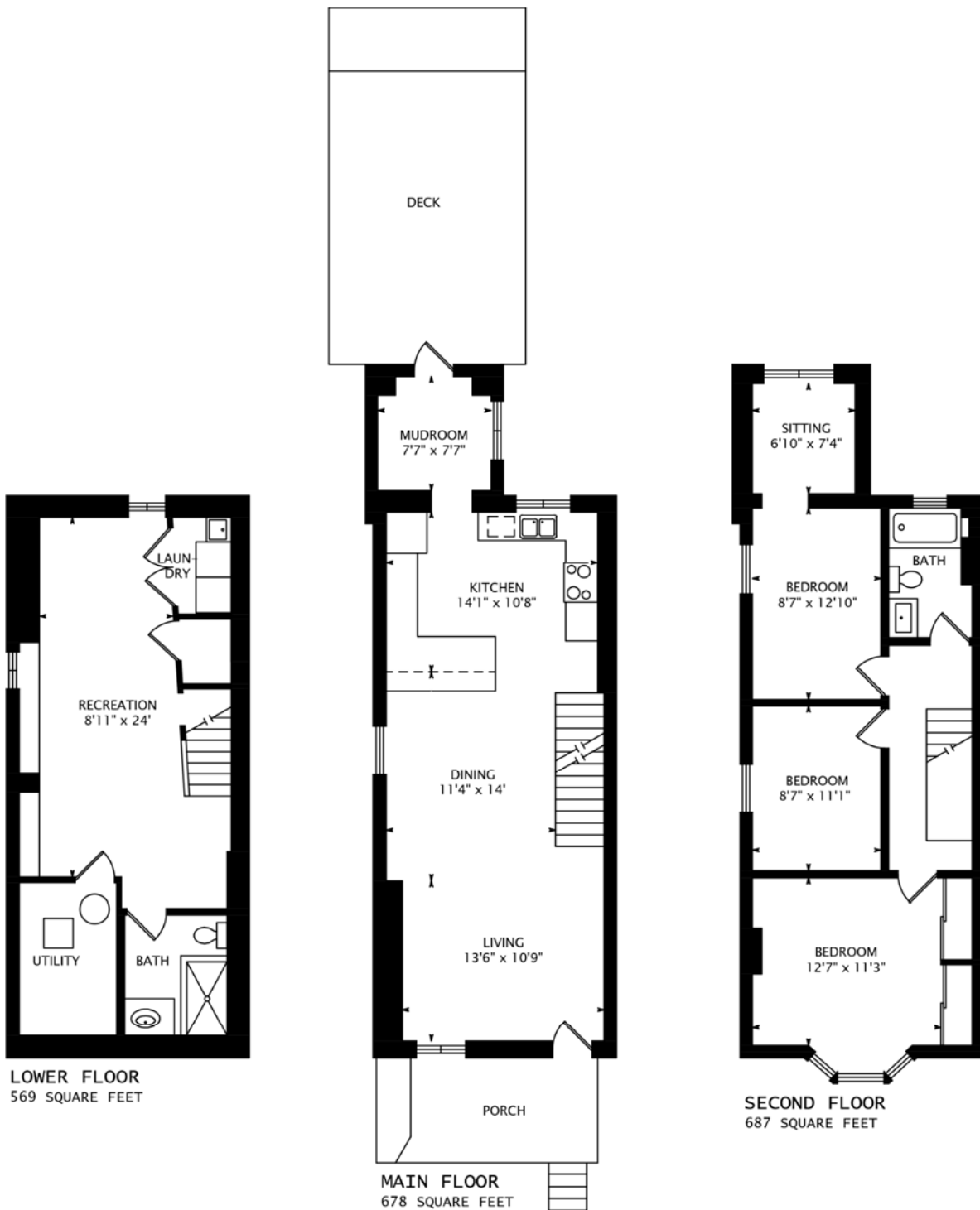
LOWER FLOOR 569 SQUARE FEET