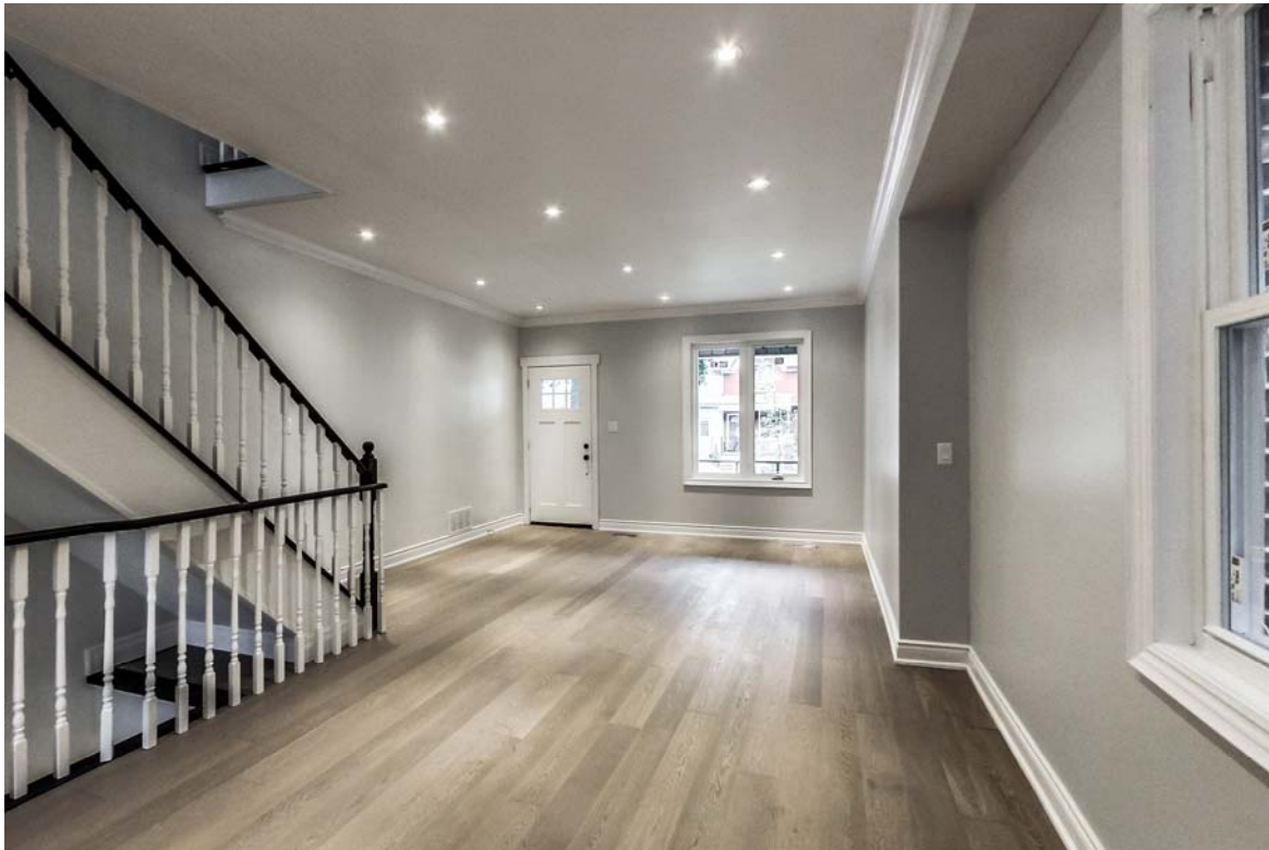
High Ceilings & Spacious Open-Concept Main Floor