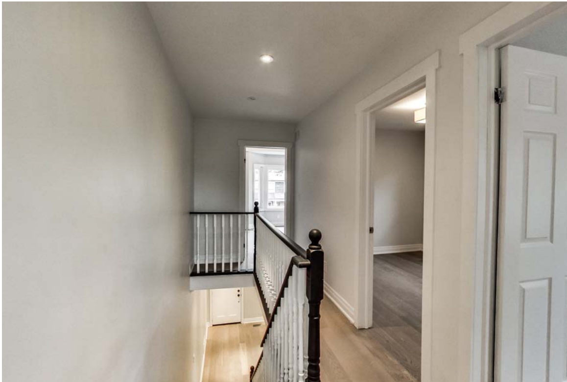
Two Additional Bedrooms plus a Den and Finished Basement