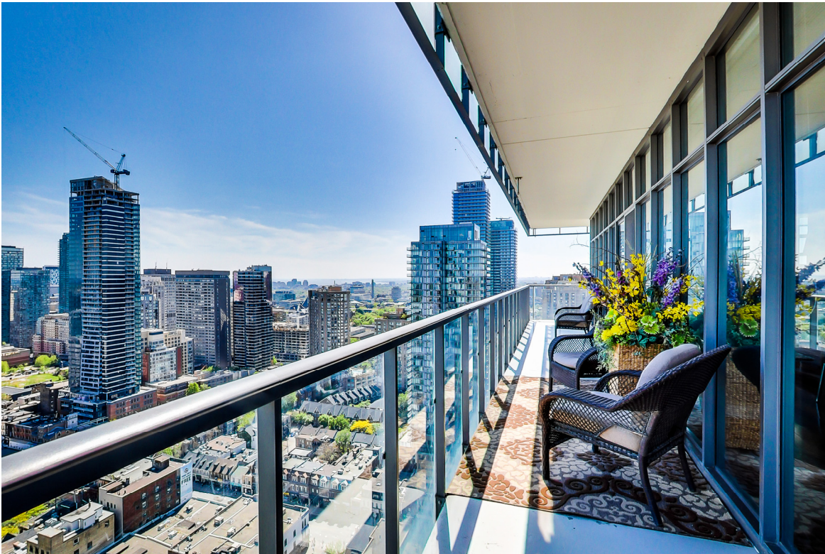
Spectacular Wrap-Around Balcony