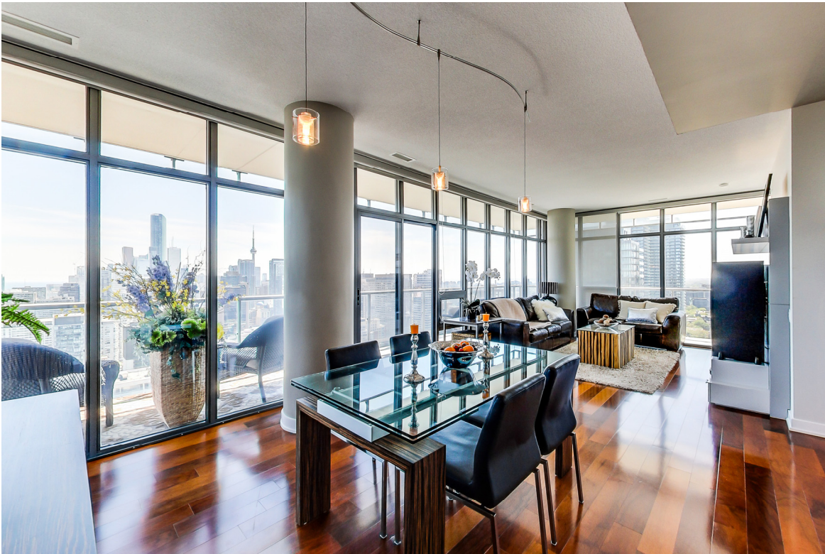
Upgraded Flooring, Broadloom and other Finishes Throughout