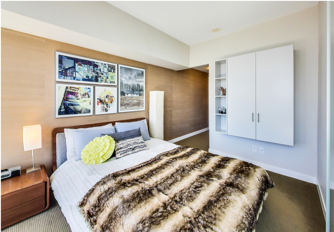
Rarely Available Southwest Corner Suite Boasts 2 Bedrooms, 2 Full Baths Plus a Den